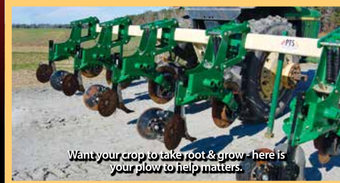
Want your crop to take root & grow - here is your plow to help matters.