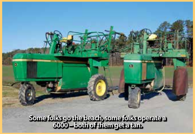
Some folks go the beach, some folks operate a 6000 - both of them get a tan.