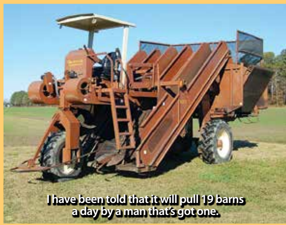
I have been told that it will pull 19 barns a day by a man that's got one.