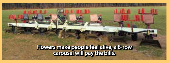
Flowers make people feel alive, a 8-row carousel will pay the bills.