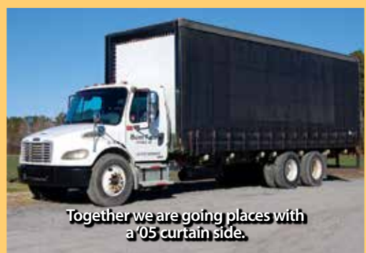
Together we are going places with a '05 curtain side.