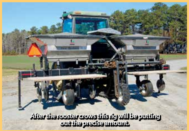
After the rooster crows this rig will be putting out the precise amount.