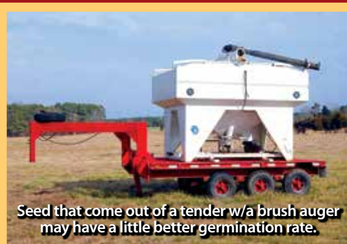
Seed that come out of a tender w/a brush auger may have a little better germination rate.