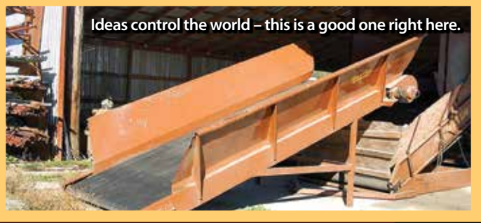
Ideas control the world – this is a good one right here.