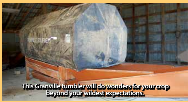
This Granville tumbler will do wonders for your crop beyond your wildest expectations.