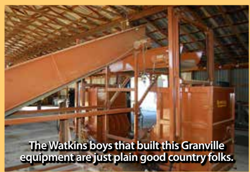
The Watkins boys that built this Granville equipment are just plain good country folks.