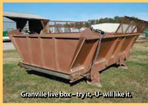
Granville live box – try it, -U- will like it.