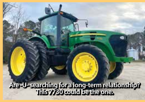
Are-U- searching for a long-term relationship? This 7730 could be the one.

SALES TAX INFO We are now required to charge NC Sales Tax at our sales. If you we do not have a completed sales tax exempt on file, you will be charged NC Sales Tax.