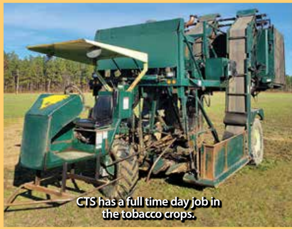
CTS has a full time day job in the tobacco crops.