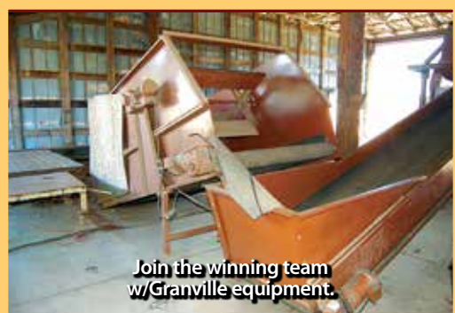
Join the winning team w/Granville equipment.