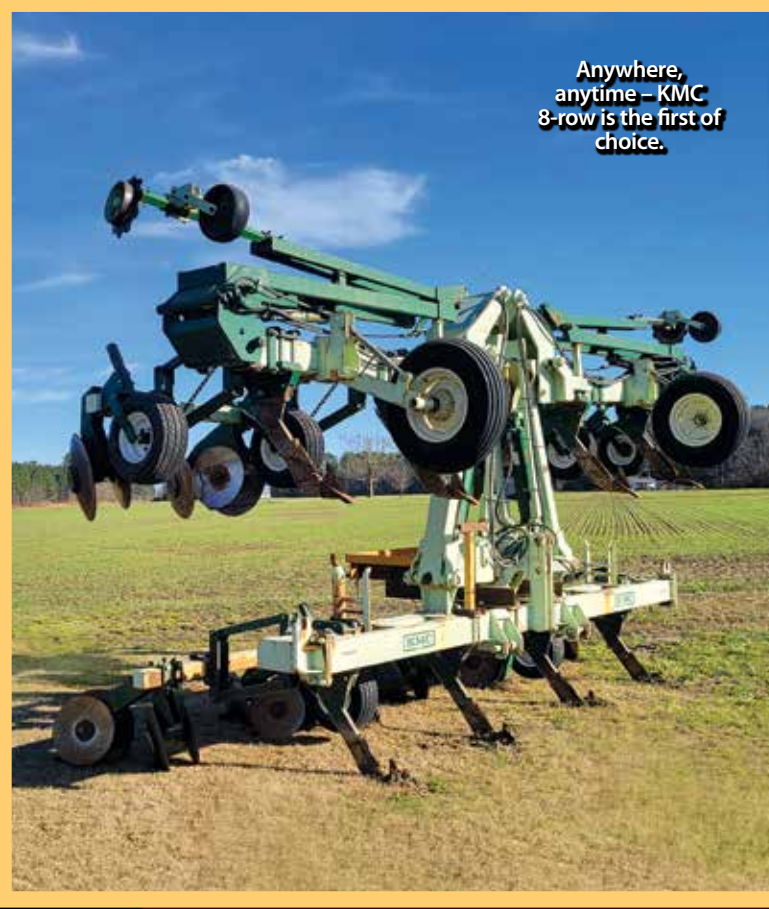
Anywhere, anytime – KMC 8-row is the first of choice.

DIRECTIONS: Being on Hwy. 30, 6 miles east of Bethel & 20 miles west of Washington, turn on Oakley Rd., travel 1.5 miles, turn left on Stokes Elementary School Rd., travel .6-mile, sale on right. Also being in Stokes on Hwy. 903 turn on Stokes Elementary School Rd across from Country Mart, travel 1.5-mile, sale on left. Watch for auction signs. SALE SITE ADDRESS: 1460 Stokes Elementary School Rd. – Stokes, NC 27884