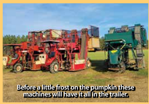
Before a little frost on the pumpkin these machines will have it all in the trailer.