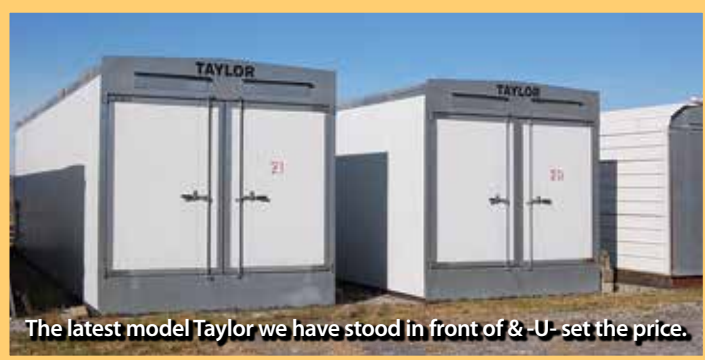
The latest model Taylor we have stood in front of & -U- set the price.

Rovatti T4100E PTO driven irrigation pump, w/suction line.