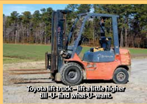
Toyota lift truck – lift a little higher till-U- find what-U- want.