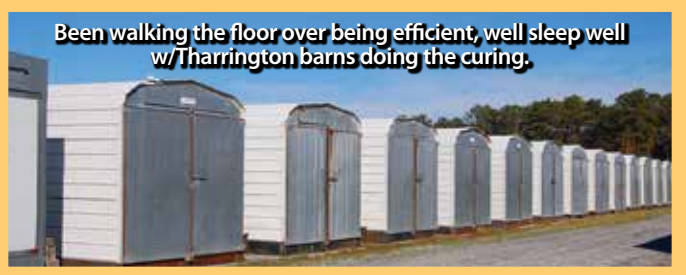
Been walking the floor over being efficient, well sleep well w/Tharrington barns doing the curing.