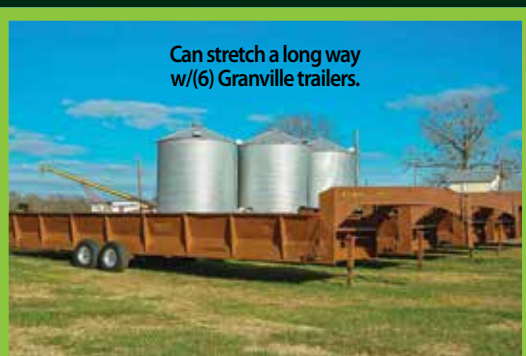
Can stretch a long way w/(6) Granville trailers.