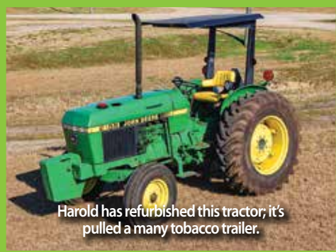
Harold has refurbished this tractor; it's pulled a many tobacco trailer.