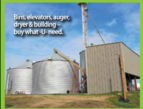
Bins, elevators, auger, dryer & building – buy what -U- need.