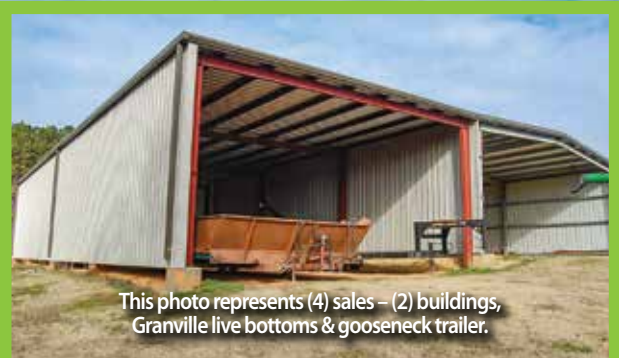
This photo represents (4) sales – (2) buildings, Granville live bottoms & gooseneck trailer.