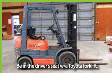
Be in the driver's seat w/a Toyota forklift.

John Deere 1990 , 30' air drill, w/Haukaas hydraulic row markers, runs thru Greenstar display.