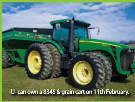
-U- can own a 8345 & grain cart on 11th February.