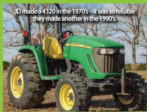
JD made a 4320 in the 1970's – it was so reliable they made another in the 1990's.