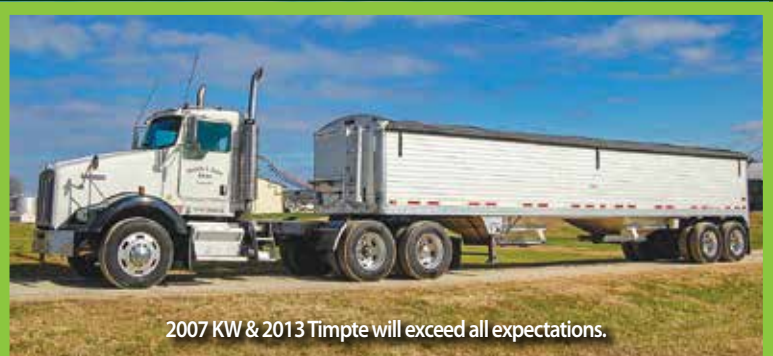
2007 KW & 2013 Timpte will exceed all expectations.