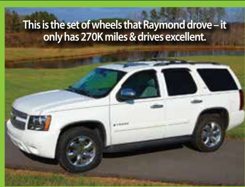
This is the set of wheels that Raymond drove – it only has 270K miles & drives excellent.