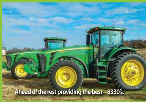
Ahead of the rest providing the best – 8330's.