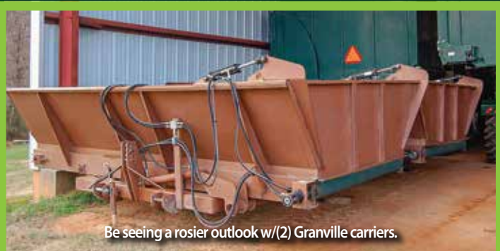
Be seeing a rosier outlook w/(2) Granville carriers.