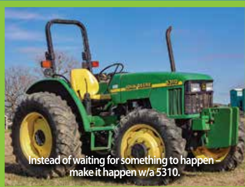
Instead of waiting for something to happen – make it happen w/a 5310.