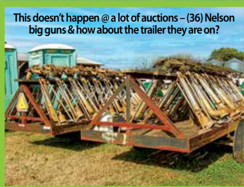
This doesn't happen @ a lot of auctions – (36) Nelson big guns & how about the trailer they are on?