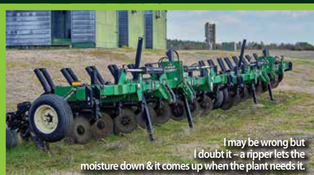
I may be wrong but I doubt it – a ripper lets the moisture down & it comes up when the plant needs it.