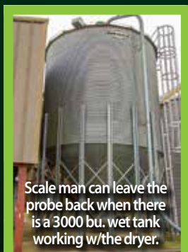
Scale man can leave the probe back when there is a 3000 bu. wet tank working w/the dryer.