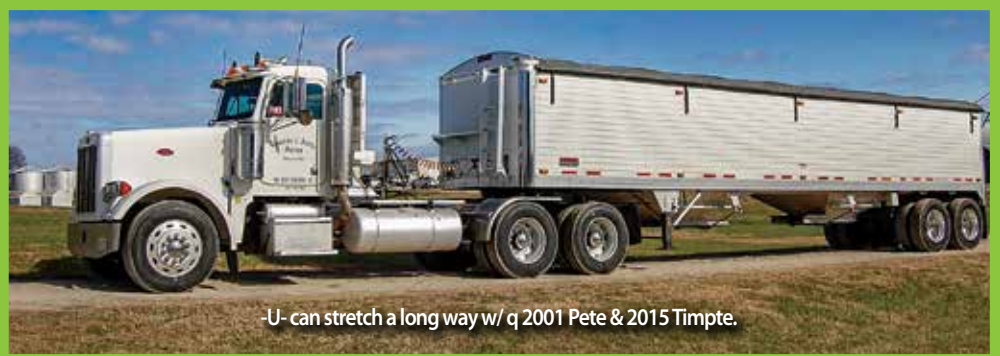
-U- can stretch a long way w/ q 2001 Pete & 2015 Timpte.