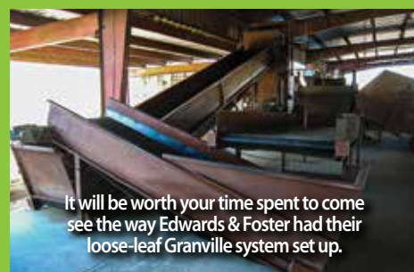
It will be worth your time spent to come see the way Edwards & Foster had their loose-leaf Granville system set up.