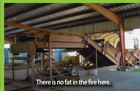
There is no fat in the fire here.