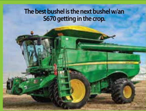
The best bushel is the next bushel w/a S670 getting in the crop.