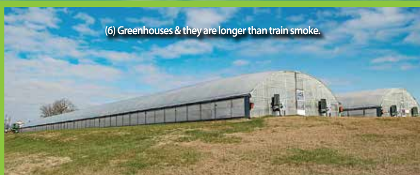
(6) Greenhouses & they are longer than train smoke.