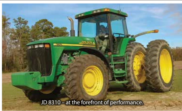
JD 8310 – at the forefront of performance.