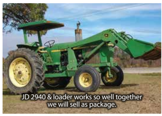
JD 2940 & loader works so well together we will sell as package.