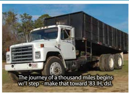
The journey of a thousand miles begins w/1 step - make that toward '83 IH, dsl.