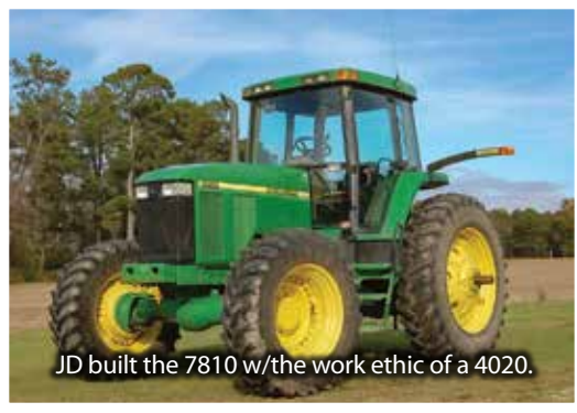
JD built the 7810 w/the work ethic of a 4020.