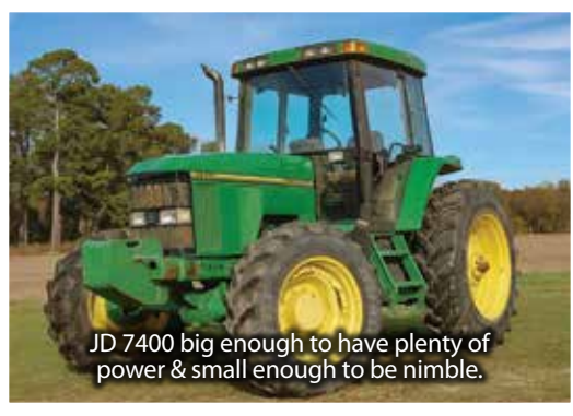
JD 7400 big enough to have plenty of power & small enough to be nimble.