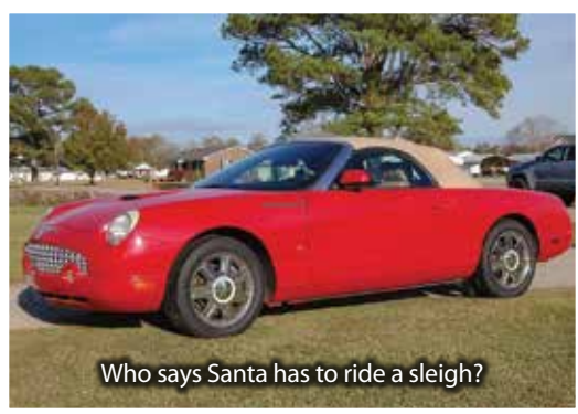
Who says Santa has to ride a sleigh?