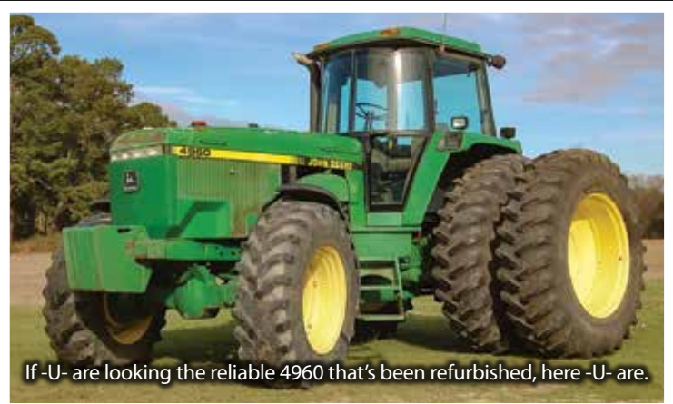
If -U- are looking the reliable 4960 that's been refurbished, here -U- are.