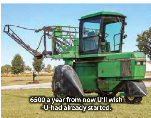
6500 a year from now U'll wish -U-had already started.