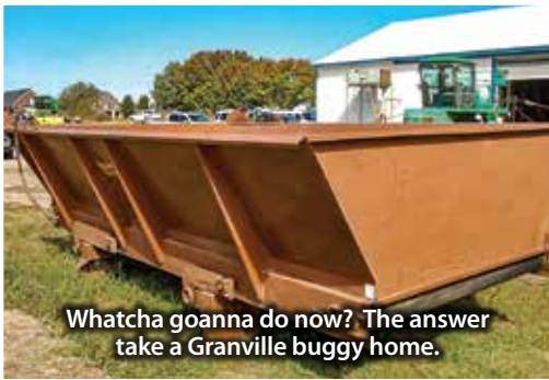
Whatcha goanna do now? The answer take a Granville buggy home.