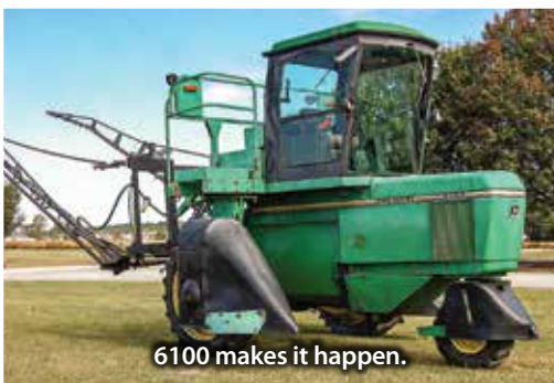
6100 makes it happen.