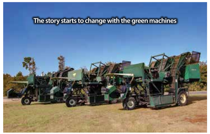
The story starts to change with the green machines