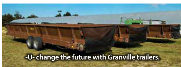
-U- change the future with Granville trailers.

Other non-conflicting absolute consignments accepted.