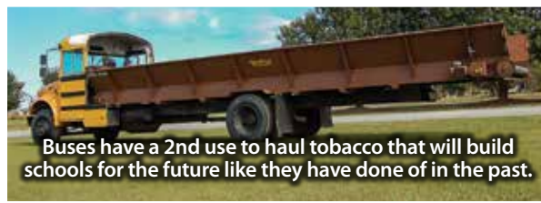
Buses have a 2nd use to haul tobacco that will build schools for the future like they have done of in the past.

2006 & 2004 Chevy 1500 4x4, extended cab, short bed, 8-cyl gas, automatic, 17" tires, former NCDOT trucks, 182,179 miles, 195,734.