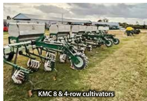
KMC 8 & 4-row cultivators

A his & hers mowing machine – when -U- get thru -U- will have more time for fishing & kissing.