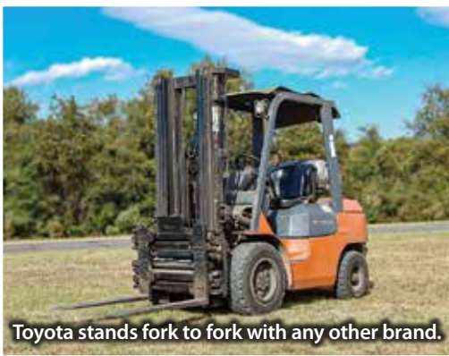
Toyota stands fork to fork with any other brand.