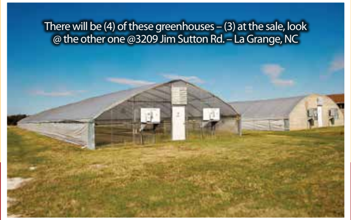
There will be (4) of these greenhouses – (3) at the sale, look @ the other one @3209 Jim Sutton Rd. – La Grange, NC