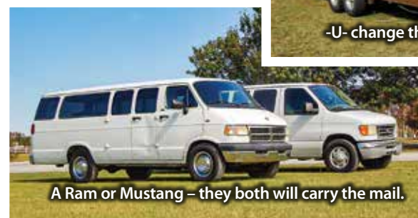
A Ram or Mustang – they both will carry the mail.