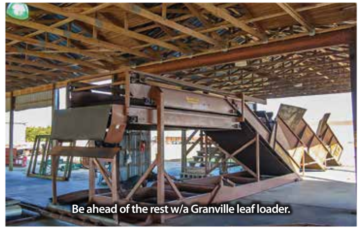
Be ahead of the rest w/a Granville leaf loader.