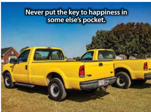
Never put the key to happiness in some else's pocket.