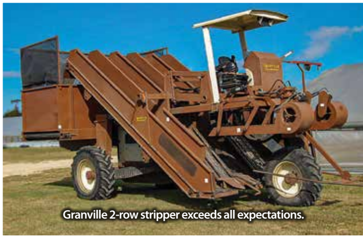
Granville 2-row stripper exceeds all expectations.