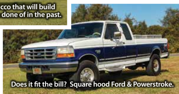
Does it fit the bill? Square hood Ford & Powerstroke.