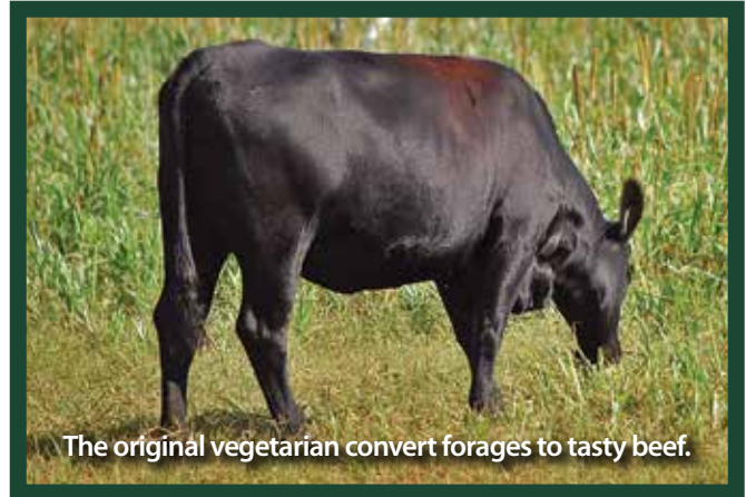
The original vegetarian convert forages to tasty beef.