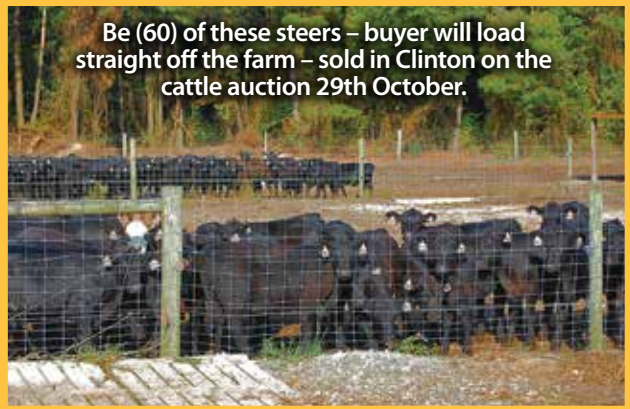
Be (60) of these steers – buyer will load straight off the farm – sold in Clinton on the cattle auction 29th October.