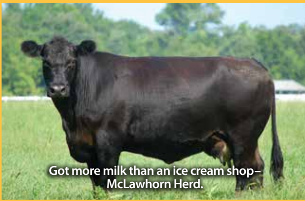
Got more milk than an ice cream shop – McLawnhorn Herd.