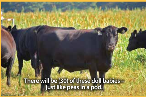
There will be (30) of these doll babies – just like peas in a pod.

Sale order available sale day or check the web late Friday afternoon for posting. Print before you come & have a head start w/the pens marked that will fit your farm.