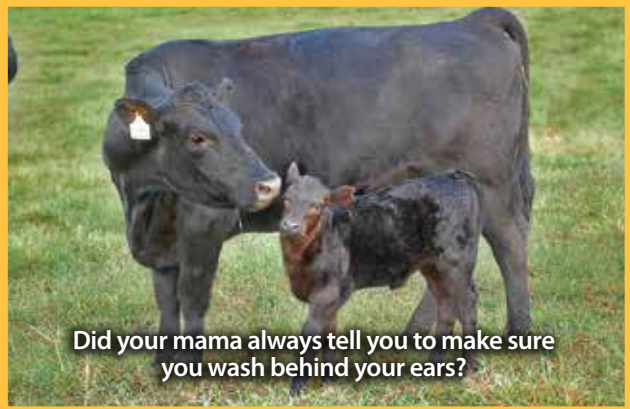
Did your mama always tell you to make sure you wash behind your ears?