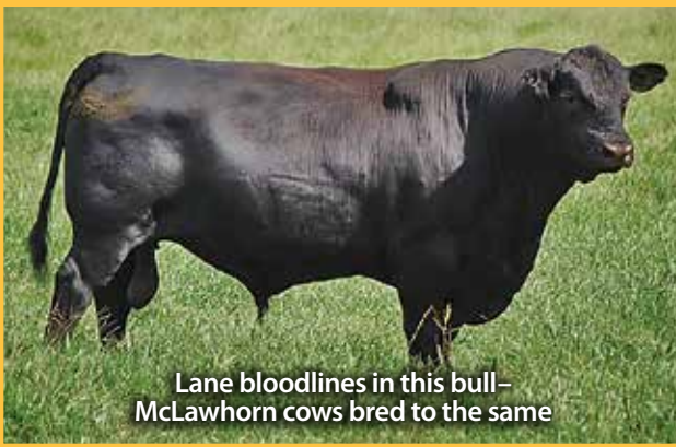
Lane bloodlines in this bull – McLawnhorn cows bred to the same