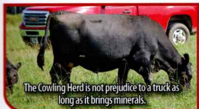
The Cowling Herd is not prejudice to a truck as long as it brings minerals.

– (4) pairs & (23) 2nd calvers for fall calving – bred to Lane Angus bull, approx. 1250#, great udders, slick hair, all home raised, forage based, winter time offered protein tub with hay, kept behind 1 & 2-strand electric fence, vaccinated with Triangle 10, these cattle will be the front pasture kind.