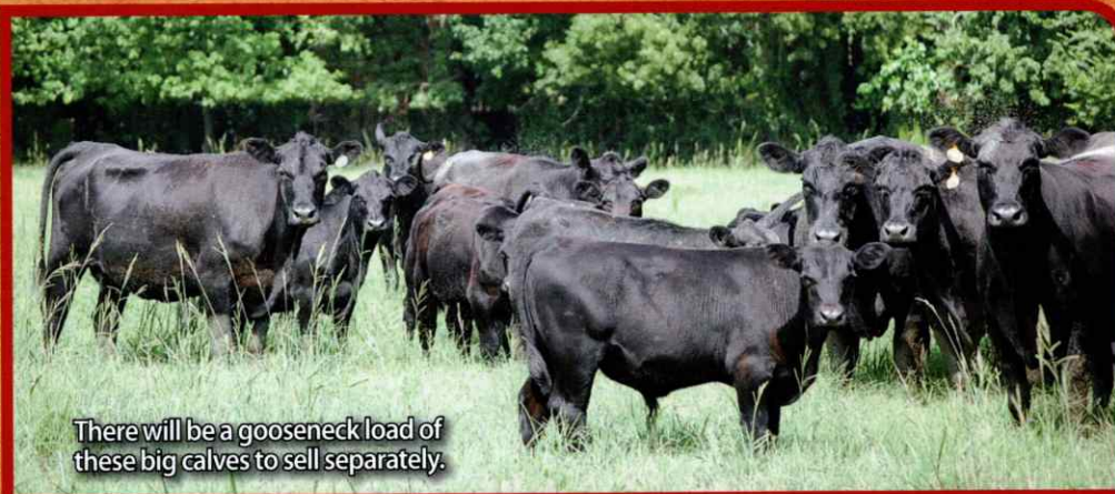
There will be a gooseneck load of these big calves to sell separately.