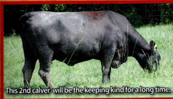
This 2nd calver will be the keeping kind for a long time.