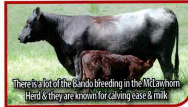
There is a lot of the Bando breeding in the McLawhorn Herd & they are known for calving ease & milk

(2) 100% Fleckvieh Simmental bulls, DOB: 4/21 OZ BW 97#, & DOB 5/20 -Oak BW 91#, add a lot of growth to any herd, gentle & easy keepers.