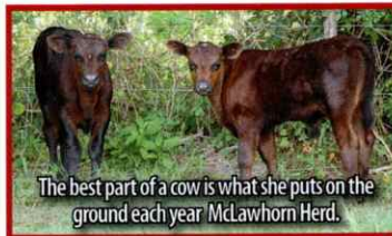
The best part of a cow is what she puts on the ground each year. McLawhorn Herd.