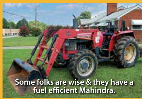
Some folks are wise & they have a fuel efficient Mahindra.