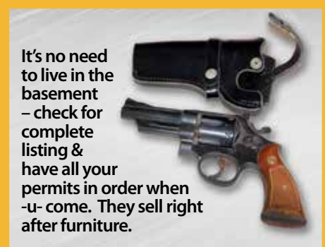
It's no need to live in the basement - check for complete listing & have all your permits in order when -u- come. They sell right after furniture.