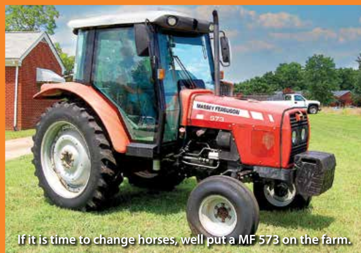
If it is time to change horses, well put a MF 573 on the farm.