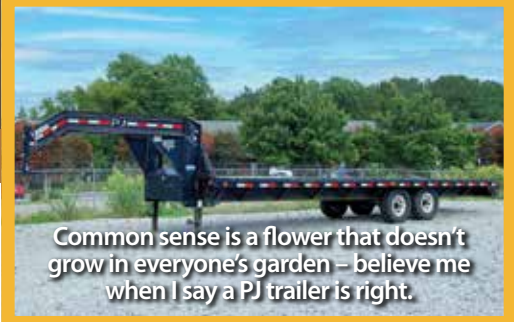
Common sense is a flower that doesn't grow in everyone's garden – believe me when I say a PJ trailer is right.

12'x76'x8' metal shelter. 18'x42'x7 1/2' wooden frame shelter w/metal sides & top.