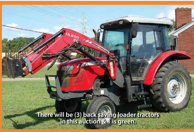
There will be (3) back saving loader tractors in this auction & 1 is green.