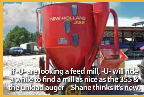
If U- are looking a feed mill, -U- will ride a while to find a mill as nice as the 355 & the unload auger – Shane thinks it's new.