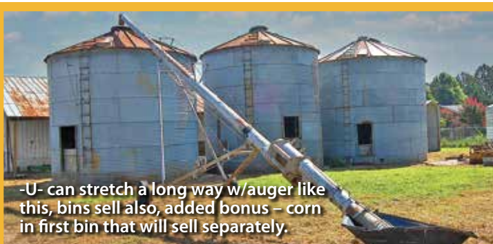
-U- can stretch a long way w/auger like this, bins sell also, added bonus – corn in first bin that will sell separately.