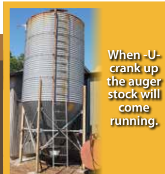
When -U- crank up the auger stock will come running.