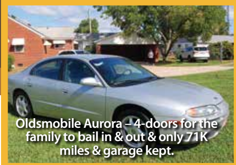
Oldsmobile Aurora - 4-doors for the family to bail in & out & only 71K miles & garage kept.