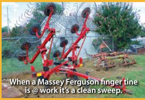
When a Massey Ferguson finger tine is @ work it's a clean sweep.