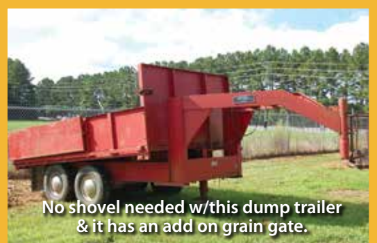
No shovel needed w/this dump trailer & it has an add on grain gate.