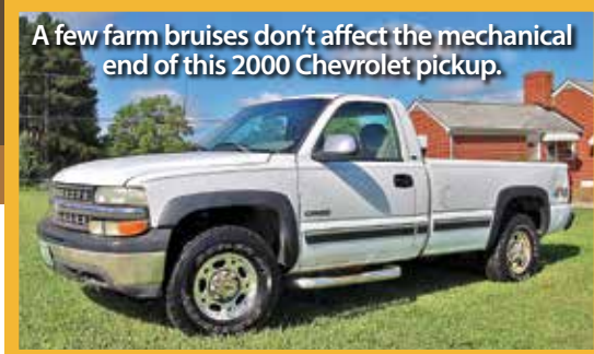
A few farm bruises don't affect the mechanical end of this 2000 Chevrolet pickup.