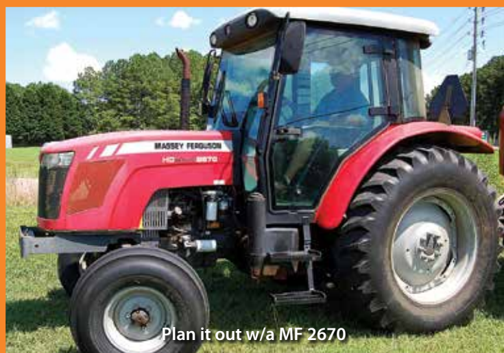
Plan it out w/a MF 2670