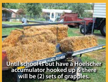
Until school is out have a Hoelscher accumulator hooked up & there will be (2) sets of grapples.