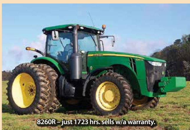
8260R – just 1723 hrs. sells w/a warranty.

SALE SITE ADDRESS: 2254 Hwy. 58 - Warrenton, NC 27589