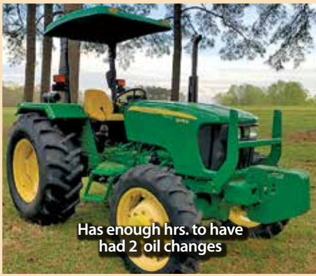
Has enough hrs. to have had 2 oil changes