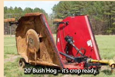
20' Bush Hog – it's crop ready.