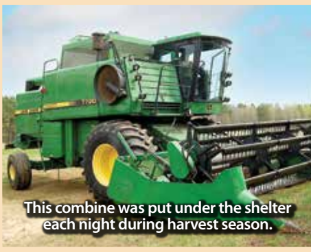
This combine was put under the shelter each night during harvest season.