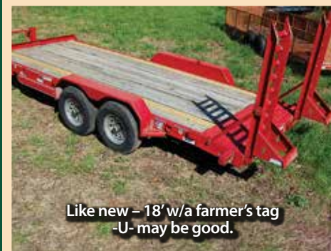
Like new – 18' w/a farmer's tag -U- may be good.

Warranty Note : When E.B. says there is a warranty with certain items, there will be a time frame for warranty to be in effect answered on sale day time. The way it works, buyer will return the item & a full refund will be issued to the buyer. There will be no adjustment $$$$ given, just a full amount purchase when it is returned by specific date.