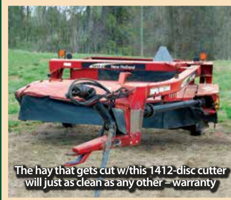
The hay that gets cut w/this 1412-disc cutter will just as clean as any other – warranty