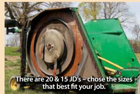
There are 20 & 15 JD's – chose the sizes that best fit your job.

Breeders of the Carolina Santa Gertrudis Sale Saturday, 12th May, 12:00 • Chester, SC