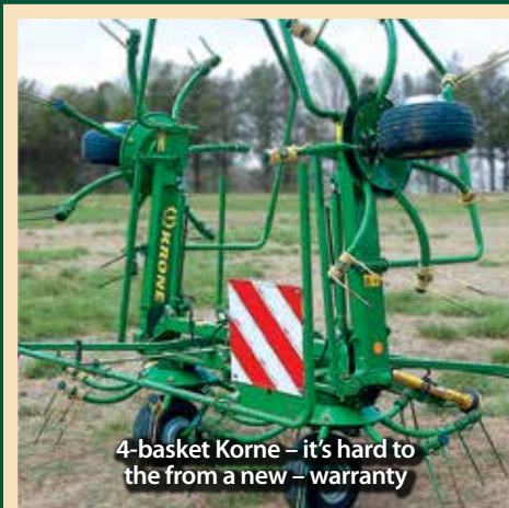
4-basket Korne – it's hard to the from a new – warranty