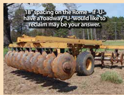
18" spacing on the Rome – if U- have a roadway-U- would like to reclaim may be your answer.

Case 1840 skid steer, less than 300 hrs. on engine.