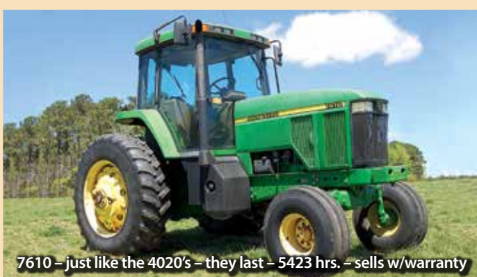
7610 – just like the 4020's – they last – 5423 hrs. – sells w/warranty