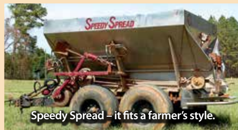
Speedy Spread – it fits a farmer's style.