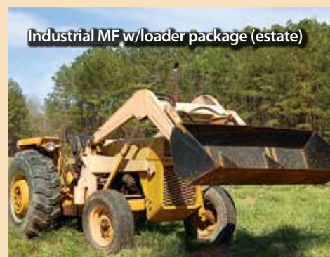
Industrial MF w/loader package (estate)