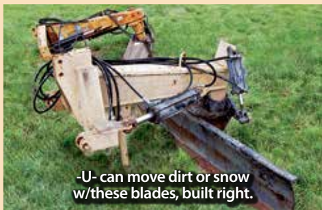
-U- can move dirt or snow w/these blades, built right.