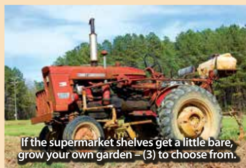
If the supermarket shelves get a little bare, grow your own garden – (3) to choose from.