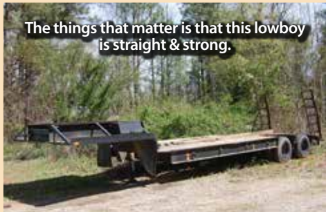
The things that matter is that this lowboy is straight & strong.