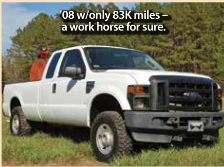
'08 w/only 83K miles – a work horse for sure.