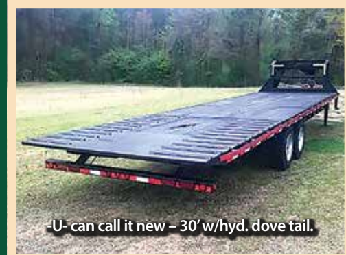
-U- can call it new – 30' w/hyd. dove tail.