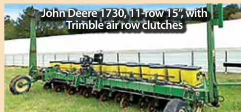
John Deere 1730, 11-row 15", with Trimble air row clutches