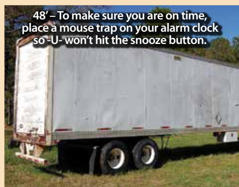
48' – To make sure you are on time, place a mouse trap on your alarm clock so-U- won't hit the snooze button.