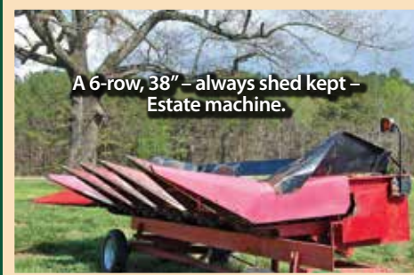
A 6-row, 38" – always shed kept – Estate machine.