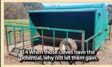
14 When those calves have the potential, why not let them gain.