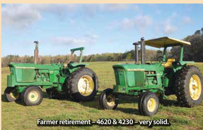
Farmer retirement – 4620 & 4230 – very solid.