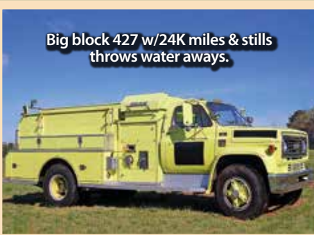
Big block 427 w/24K miles & stills throws water aways.