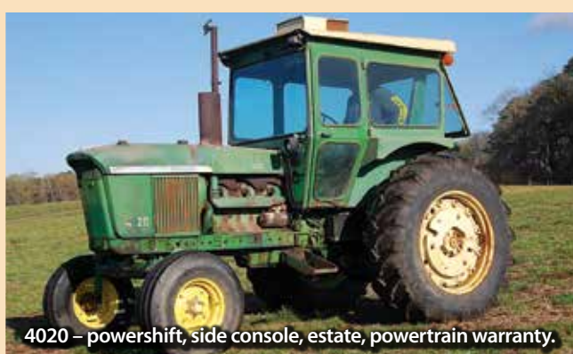
4020 – powershift, side console, estate, powertrain warranty.