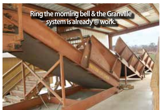
Ring the morning bell & the Granville system is already @ work.