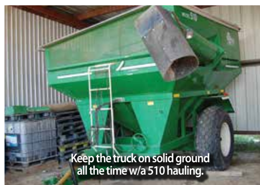
Keep the truck on solid ground all the time w/a 510 hauling.