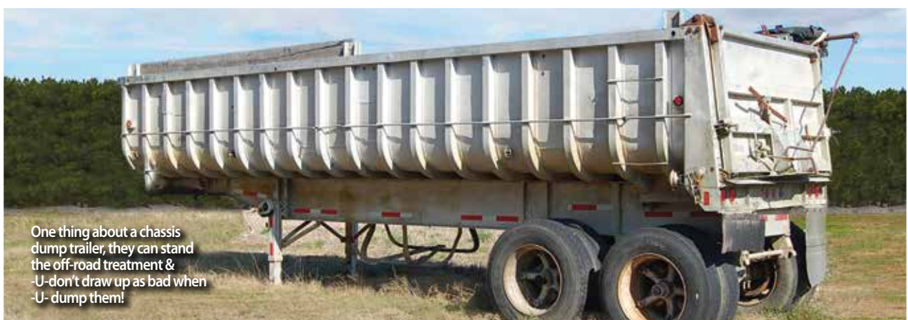
One thing about a chassis dump trailer, they can stand the off-road treatment & -U-don't draw up as bad when -U- dump them!