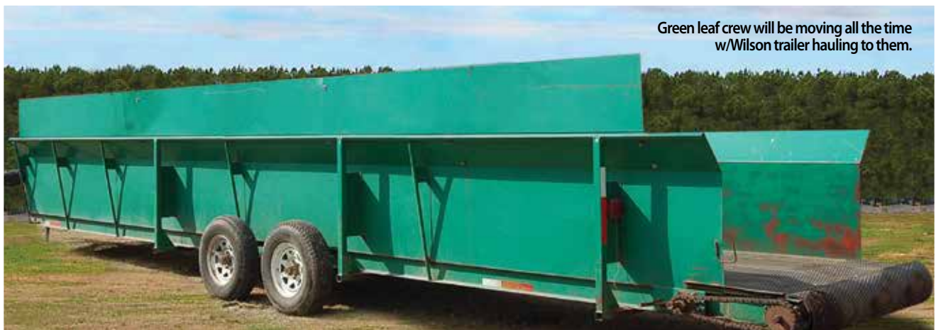
Green leaf crew will be moving all the time w/Wilson trailer hauling to them.