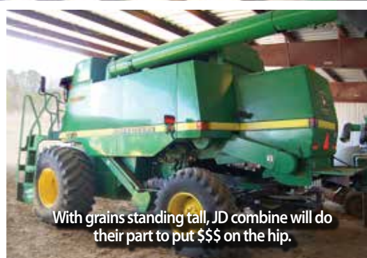
With grains standing tall, JD combine will do their part to put $$$ on the hip.