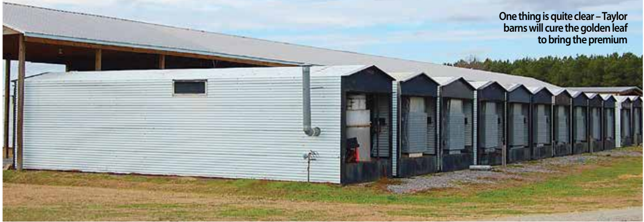
One thing is quite clear – Taylor barns will cure the golden leaf to bring the premium