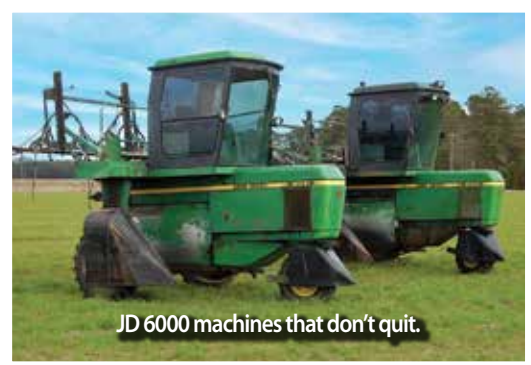
JD 6000 machines that don't quit.