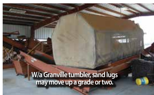
W/a Granville tumbler, sand lugs may move up a grade or two.

Sales Tax Info - We are now required to charge NC Sale Tax at our sales. If you do not have a completed sales tax exempt on file, you will be charged NC Sales Tax.