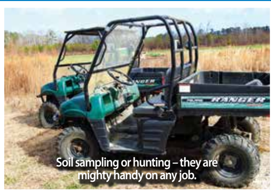
Soil sampling or hunting – they are mighty handy on any job.