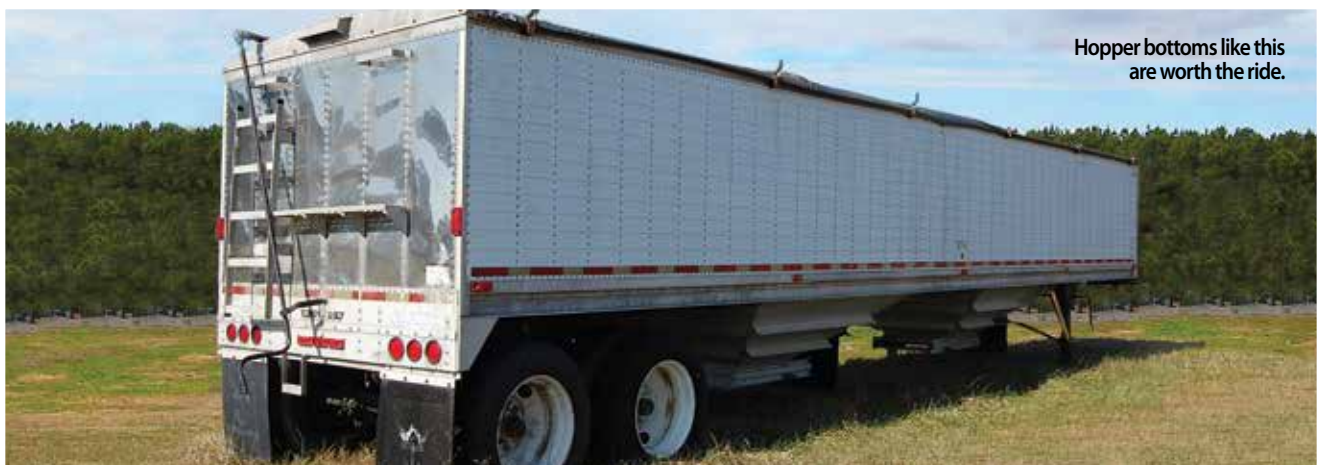
Hopper bottoms like this are worth the ride.