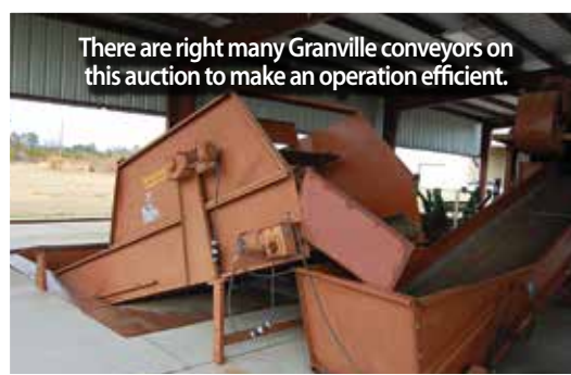
There are right many Granville conveyors on this auction to make an operation efficient.