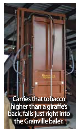
Carries that tobacco higher than a giraffe's back, falls just right into the Granville baler.

Bid on site or online @ bid.ebharris.com