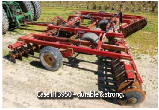
Case IH 3950 – durable & strong.