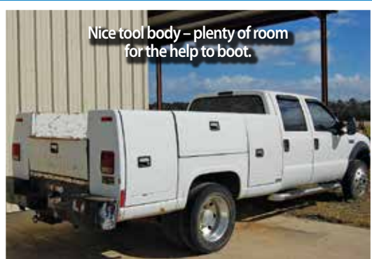
Nice tool body – plenty of room for the help to boot.