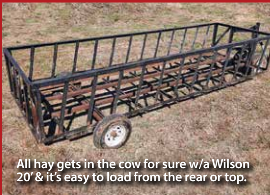
All hay gets in the cow for sure w/a Wilson 20' & it's easy to load from the rear or top.