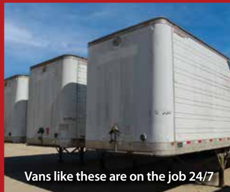
Vans like these are on the job 24/7

John Deere 513 rotary cutter, 540 pto, 3-pt.