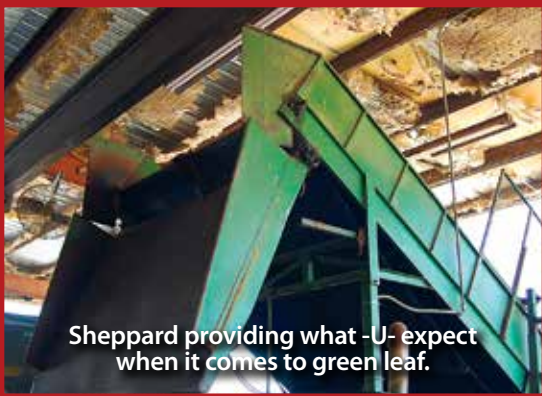
Sheppard providing what -U- expect when it comes to green leaf.

Terms & Conditions: All purchases must be paid for sale day. All property sells as is where is with all faults, with absolutely no warranties implied or expressed in any way. All Serial Numbers, mileage & hrs. unverified. All info printed in brochure is believed to be correct but not guaranteed. The auction company reserves the right to offer property in separate sales, combinations thereof or as a whole. Announcements made day of sale take precedence over printed material. Sales Tax Info – We are now required to charge NC Sale Tax at our sales. If you we do not have a completed sales tax exempt on file, you will be charged NC Sales Tax.