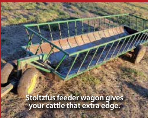
Stoltzfus feeder wagon gives your cattle that extra edge.