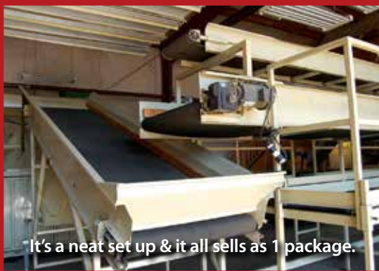
It's a neat set up & it all sells as 1 package.