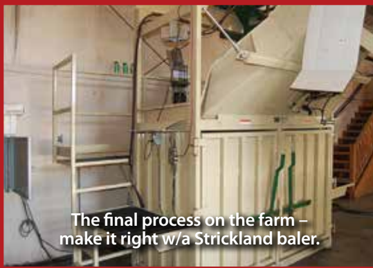
The final process on the farm – make it right w/a Strickland baler.