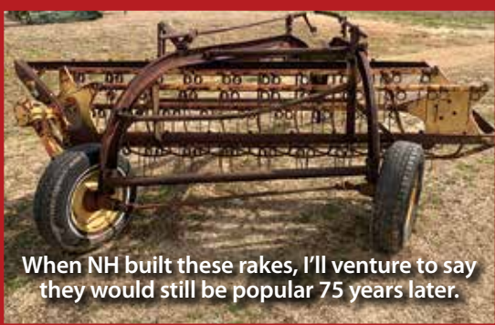
When NH built these rakes, I'll venture to say they would still be popular 75 years later.