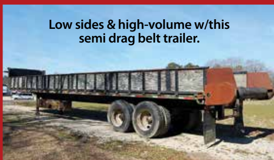
Low sides & high-volume w/this semi drag belt trailer.