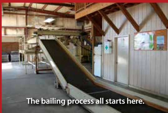
The bailing process all starts here.