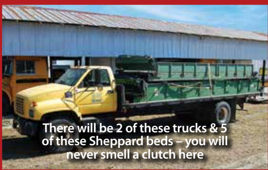
There will be 2 of these trucks & 5 of these Sheppard beds – you will never smell a clutch here