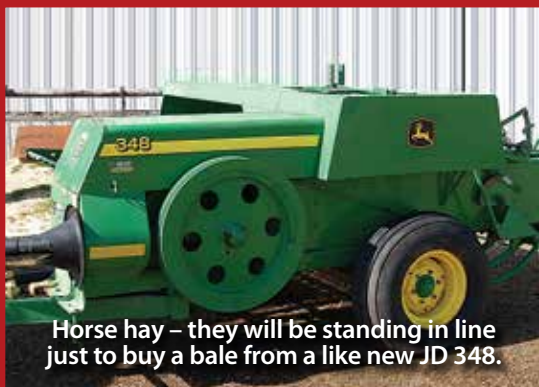
Horse hay – they will be standing in line just to buy a bale from a like new JD 348.