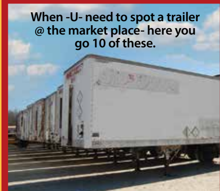
When -U- need to spot a trailer @ the market place- here you go 10 of these.