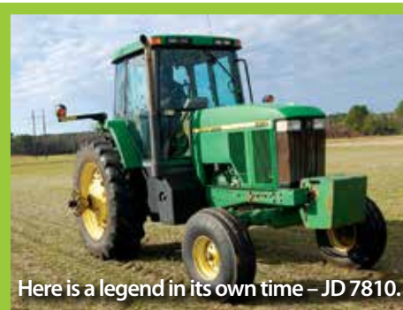
Here is a legend in its own time – JD 7810.