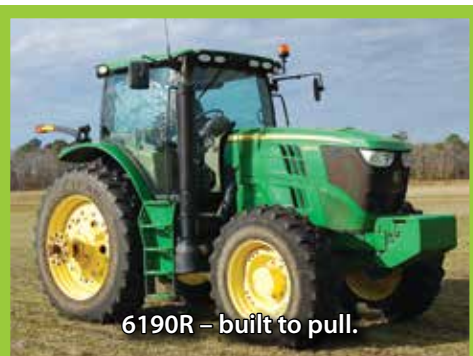
6190R – built to pull.

Reddick 150 gal. sprayer w/Flood Jet nozzle, 3-pt.