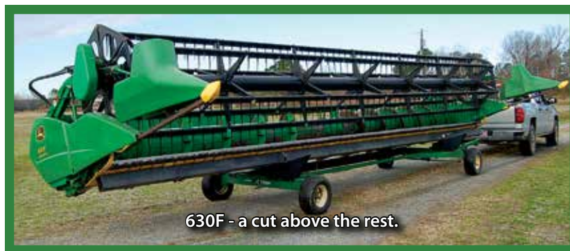
630F - a cut above the rest.