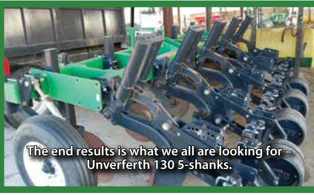
The end results is what we all are looking for – Unverferth 130 5-shanks.