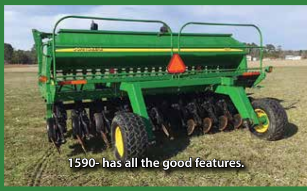
1590- has all the good features.