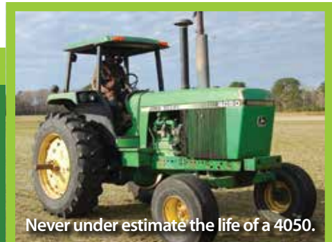
Never under estimate the life of a 4050.