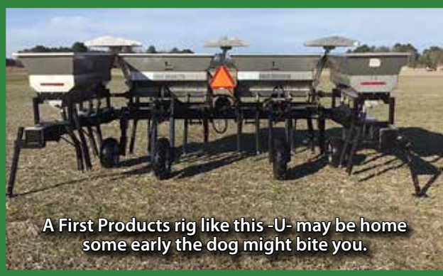
A First Products rig like this -U- may be home some early the dog might bite you.