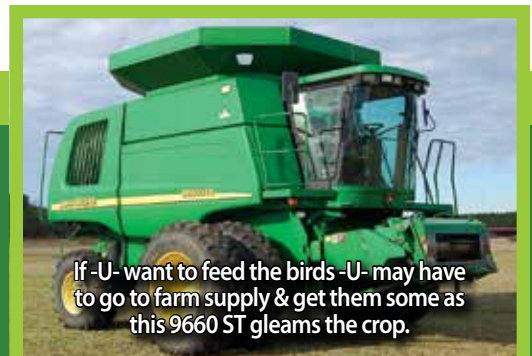
If-U- want to feed the birds -U- may have to go to farm supply & get them some as this 9660 ST gleams the crop.