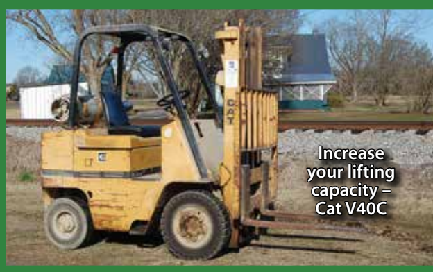
Increase your lifting capacity – Cat V40C