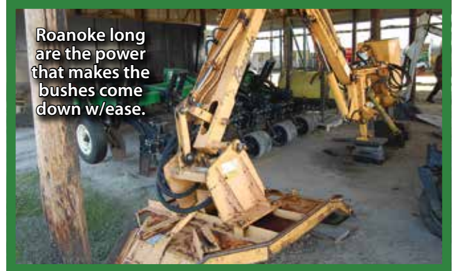
Roanoke long are the power that makes the bushes come down w/ease.