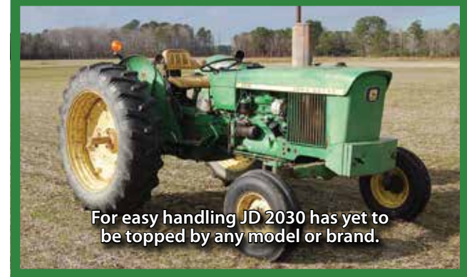
For easy handling JD 2030 has yet to be topped by any model or brand.