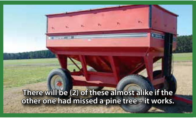
There will be (2) of these almost alike if the other one had missed a pine tree – it works.