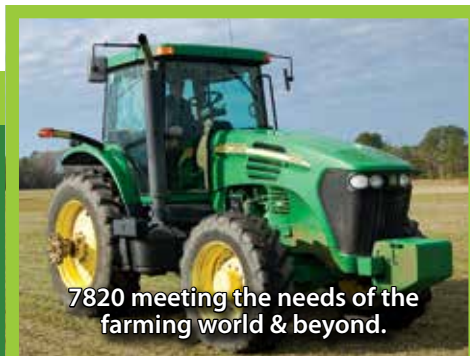
7820 meeting the needs of the farming world & beyond.