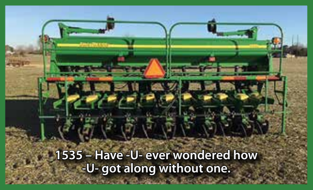
1535 – Have -U- ever wondered how -U- got along without one.