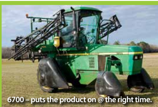
6700 – puts the product on @ the right time.

Sales Tax Info – We are now required to charge NC Sale Tax at our sales. If you do not have a completed sales tax exempt on file, you will be charged NC Sales Tax.