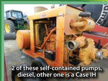
2 of these self-contained pumps, diesel, other one is a Case IH