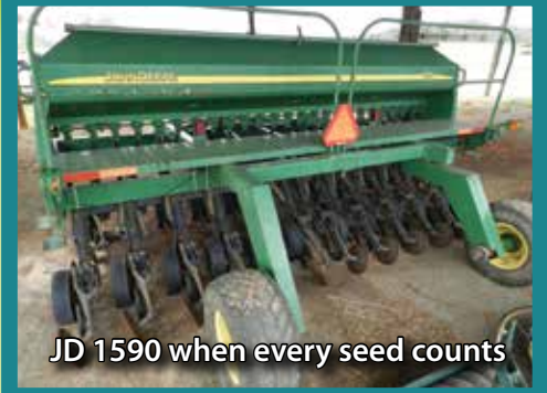
JD 1590 when every seed counts