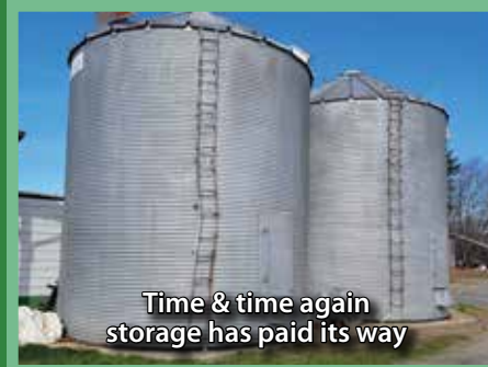
Time & time again storage has paid its way

TERMS & CONDITIONS: All purchases must be paid for sale day. All property sells as is where is with all faults, with absolutely no warranties implied or expressed in any way. All Serial Numbers, mileage & hrs. unverified. All info printed in brochure is believed to be correct but not guaranteed. The auction company reserves the right to offer property in separate sales, combinations thereof or as a whole.