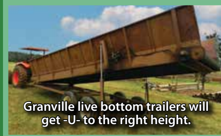
Granville live bottom trailers will get -U- to the right height.