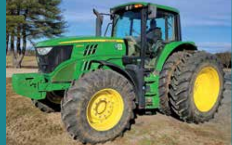
U'll be able buy the duals separately if you need.