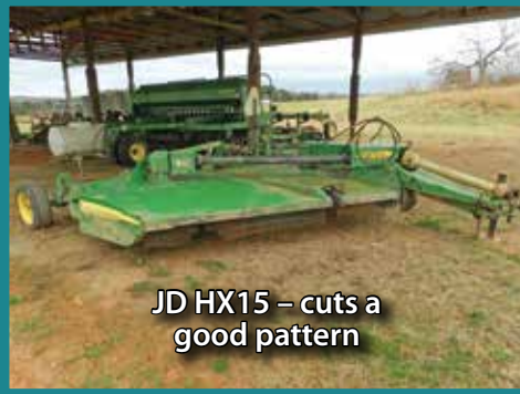
JD HX15 - cuts a good pattern