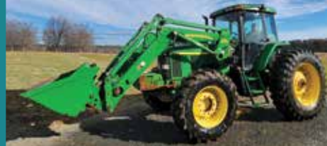
When it comes to handy, this may be the way -U- spell it – JD 7510.