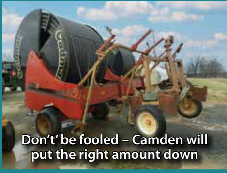
Don't be fooled - Camden will put the right amount down