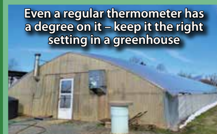
Even a regular thermometer has a degree on it – keep it the right setting in a greenhouse