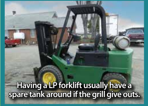
Having a LP forklift usually have a spare tank around if the grill give outs.