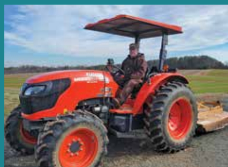
Heard on the street they are fuel efficient.