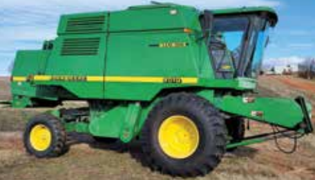
Writing is on the wall – beans are in the teens – 9510