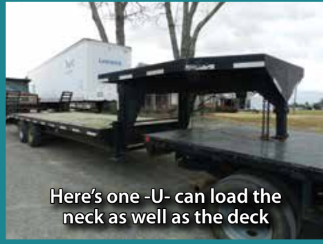
Here's one -U- can load the neck as well as the deck