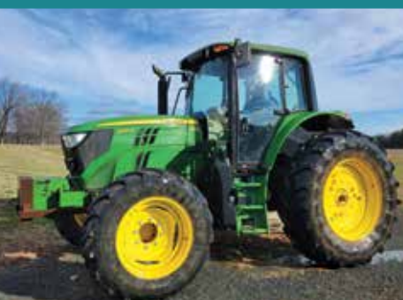
Always leading FWD w/a Deere this size