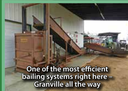
One of the most efficient baling systems right here – Granville all the way