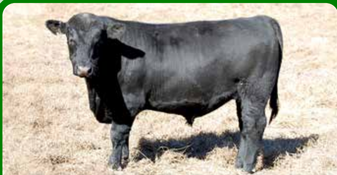
What you do on December 11, can improve your tomorrow.