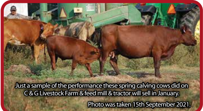
Just a sample of the performance these spring calving cows did on C & G Livestock Farm & feed mill & tractor will sell in January.