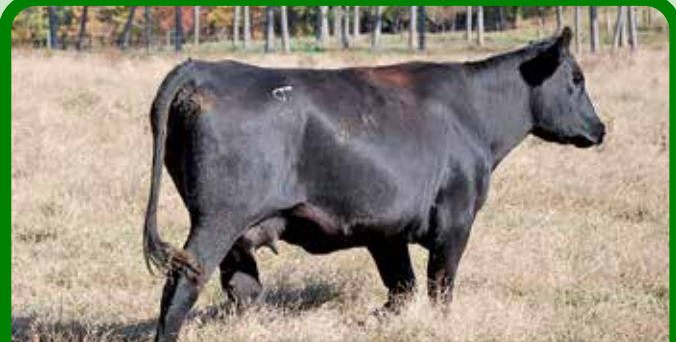
She is toting enough milk for twins if you want to raise them.