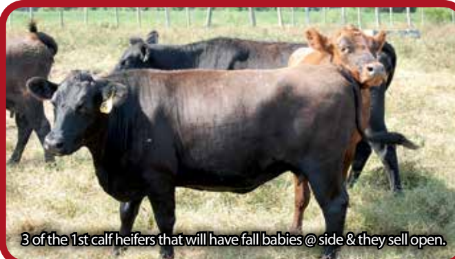
3 of the 1st calf heifers that will have fall babies @ side & they sell open.

(46) Head of cattle consisting of (30) cows average 5 yrs. of age, bred to Brasstown bull due to start calving March, (16) 1st calf heifers – open, 7 have fall calf @ side that were AI sired or Yon Angus bull, these cattle are Black, BWF, Smoke, & (4) Reds, few of heifers show a touch of Senepol, all home raised by C & G Livestock, medium frame, average 1150#, annually vaccinated & dewormed, on balance mineral program, grazing native grasses & peanut hay in the winter, only feed added to make them come when you call them, been inside electric fence. Also selling (2) jennies.