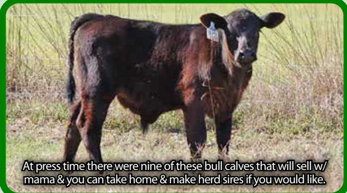
At press time there were nine of these bull calves that will sell w/ mama & you can take home & make herd sires if you would like.