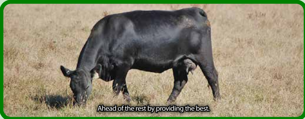
Ahead of the rest by providing the best.