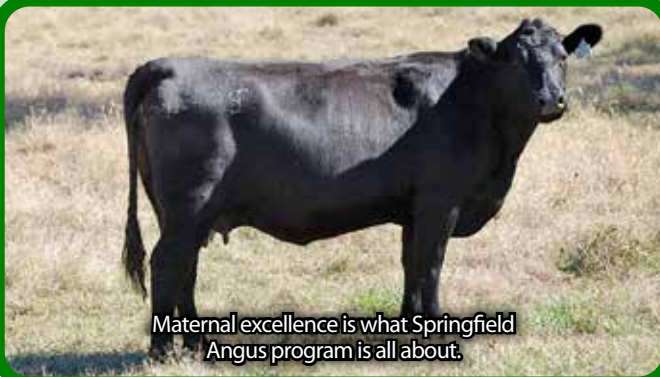
Maternal excellence is what Springfield Angus program is all about.