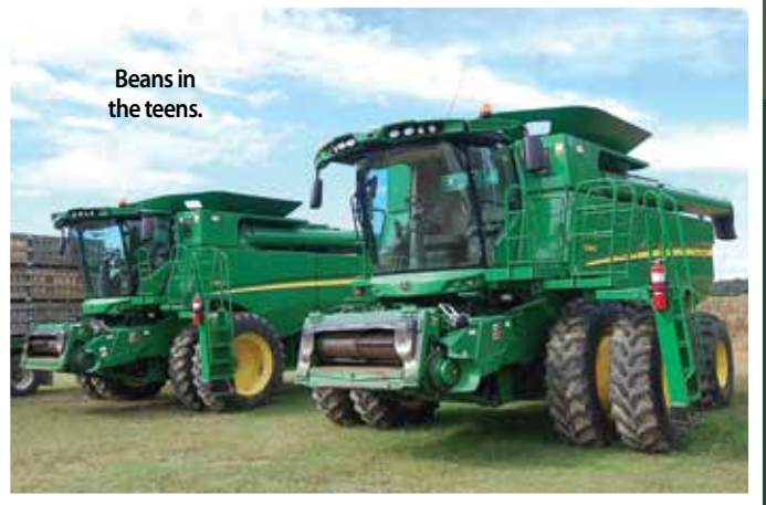
Beans in the teens.