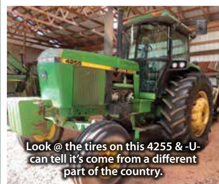
Look @ the tires on this 4255 & -U- can tell it's come from a different part of the country.