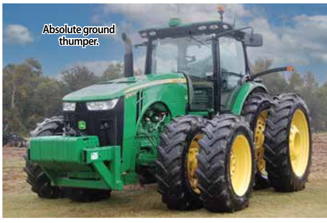
Absolute ground thumper.