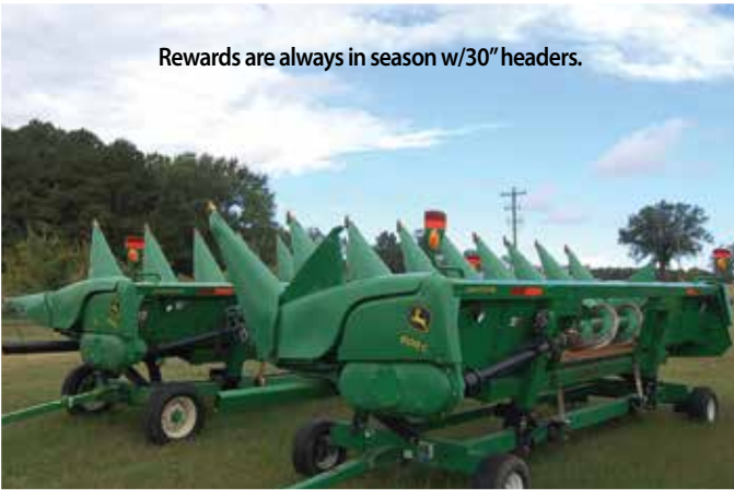
Rewards are always in season w/30" headers.