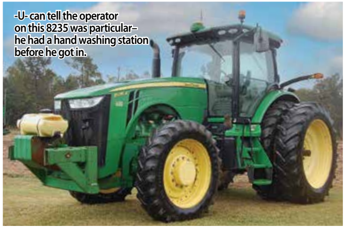
-U- can tell the operator on this 8235 was particular- he had a hand washing station before he got in.