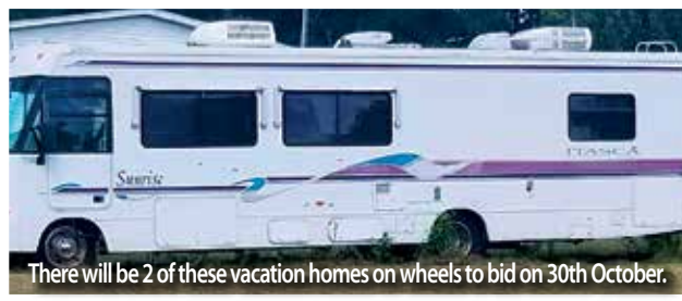
There will be 2 of these vacation homes on wheels to bid on 30th October.

SATURDAY, 30TH OCTOBER 2021 10:00 AM GASTON, NC