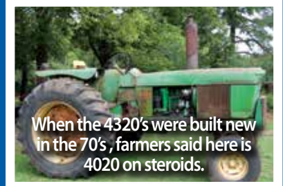
When the 4320's were built new in the 70's, farmers said here is 4020 on steroids.