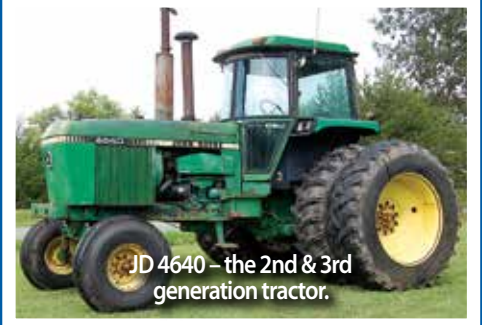
JD 4640 – the 2nd & 3rd generation tractor.