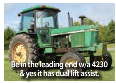
Be in the leading end w/a 4230 & yes it has dual lift assist.