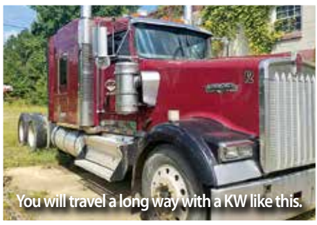
You will travel a long way with a KW like this.