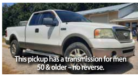
This pickup has a transmission for men 50 & older – no reverse.