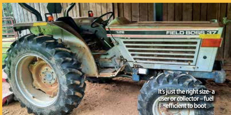
It's just the right size- a user or collector – fuel efficient to boot