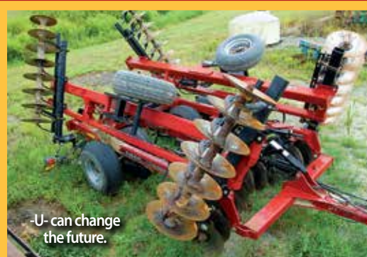
-U- can change the future.