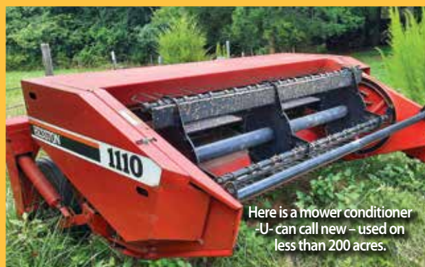
Here is a mower conditioner -U- can call new – used on less than 200 acres.