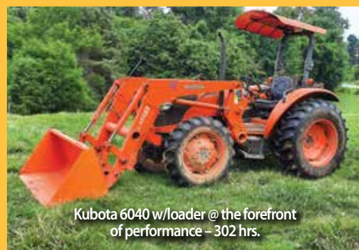
Kubota 6040 w/loader @ the forefront of performance – 302 hrs.

!!!! NOTE !!!! Bring hauling apparatus sale day – loaders will be available sale day only!!!