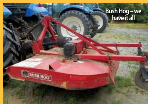
Bush Hog – we have it all