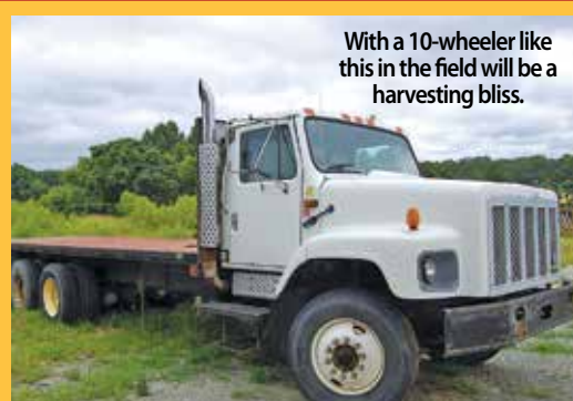
With a 10-wheeler like this in the field will be a harvesting bliss.