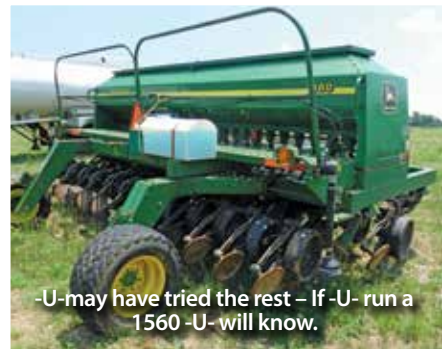
-U- may have tried the rest – If -U- run a 1560 -U- will know.