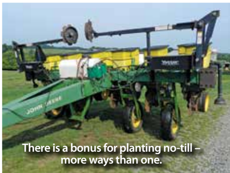
There is a bonus for planting no-till – more ways than one.