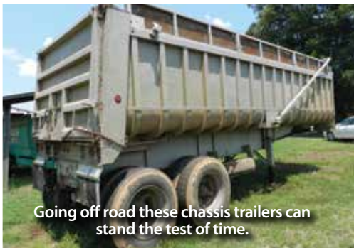
Going off road these chassis trailers can stand the test of time.