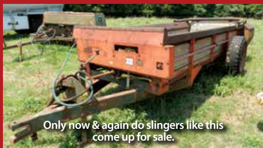
Only now & again do slingers like this come up for sale.