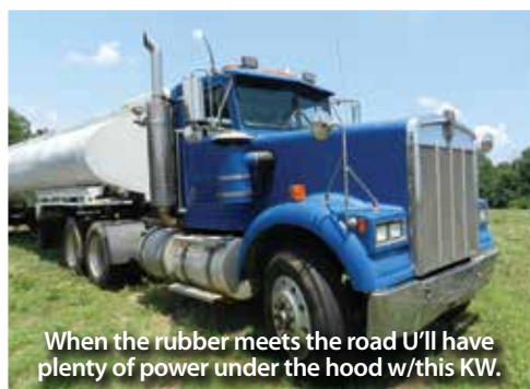
When the rubber meets the road U'll have plenty of power under the hood w/this KW.