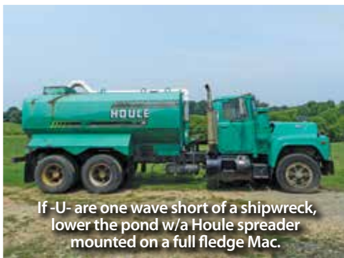
If -U- are one wave short of a shipwreck, lower the pond w/a Houle spreader mounted on a full fledged Mac.