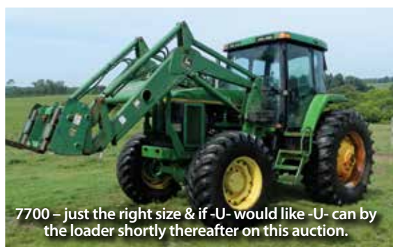
7700 – just the right size & if -U- would like -U- can by the loader shortly thereafter on this auction.

SALE SITE ADDRESS: 140 Heartland Drive – Statesville, NC 28625