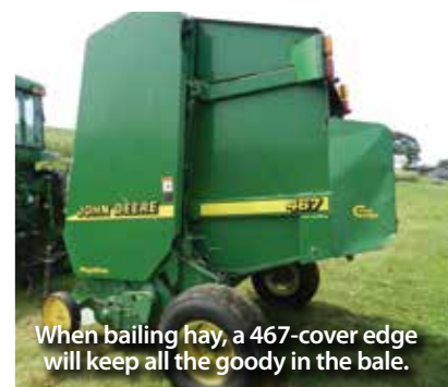
When baling hay, a 467-cover edge will keep all the goody in the bale.