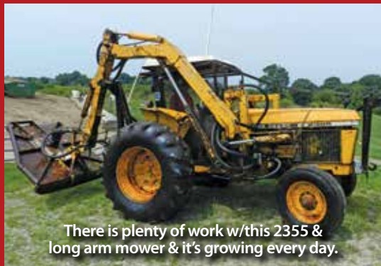
There is plenty of work w/this 2355 & long arm mower & it's growing every day.