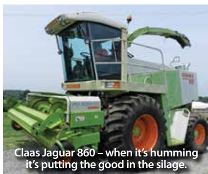
Claas Jaguar 860 – when it's humming it's putting the good in the silage.