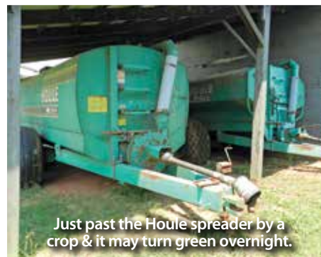
Just past the Houle spreader by a crop & it may turn green overnight.