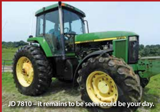
JD 7810 – it remains to be seen could be your day.