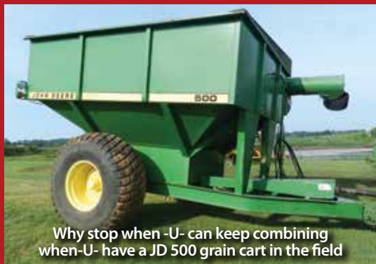
Why stop when -U- can keep combining when-U- have a JD 500 grain cart in the field