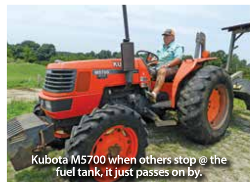
Kubota M5700 when others stop @ the fuel tank, it just passes on by.