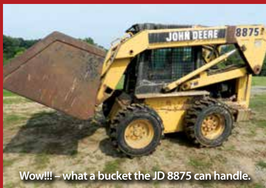
Wow!!! – what a bucket the JD 8875 can handle.