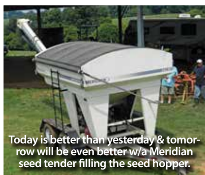
Today is better than yesterday & tomorrow will be even better w/a Meridian seed tender filling the seed hopper.