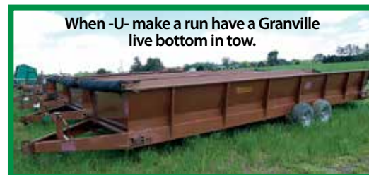
When -U- make a run have a Granville live bottom in tow.