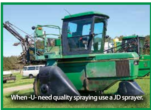
When -U- need quality spraying use a JD sprayer.