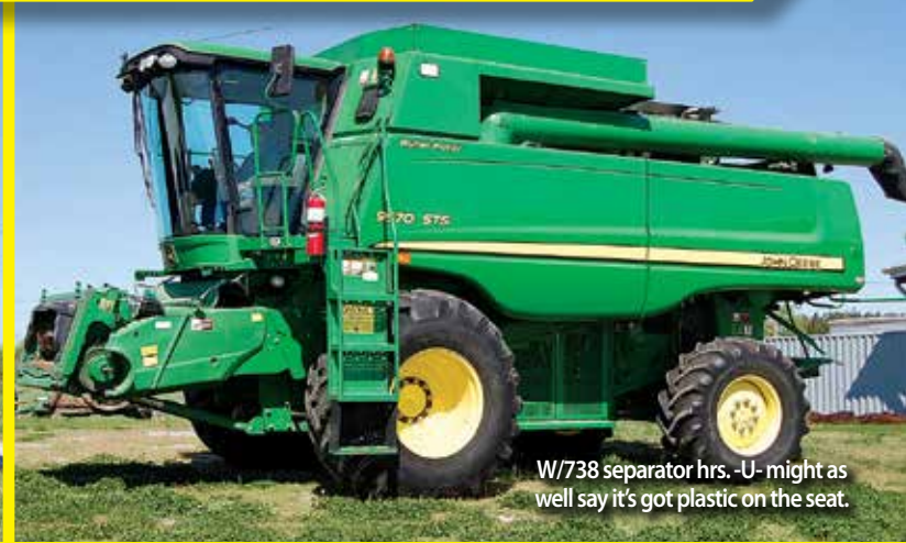
W/738 separator hrs. -U- might as well say it's got plastic on the seat.