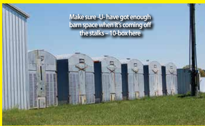
Make sure -U- have got enough barn space when it's coming off the stalks - 10-box here