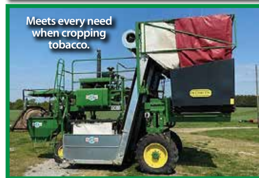
Meets every need when cropping tobacco.