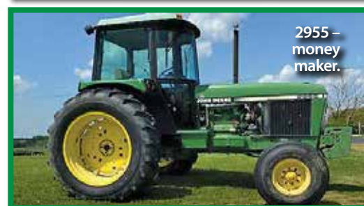
2955 - money maker.