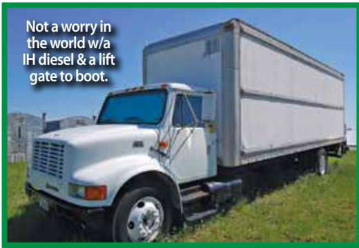
Not a worry in the world w/a IH diesel & a lift gate to boot.