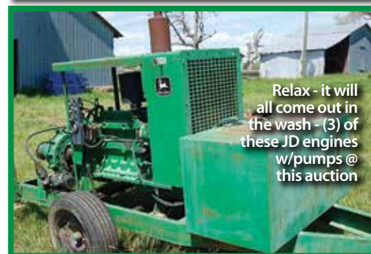
Relax - it will all come out in the wash - (3) of these JD engines w/pumps @ this auction