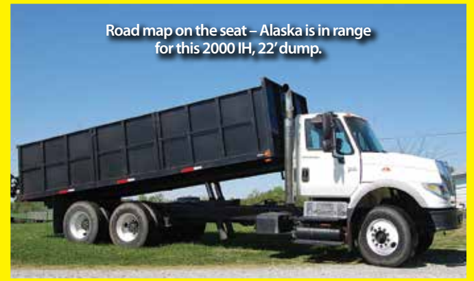
Road map on the seat - Alaska is in range for this 2000 IH, 22' dump.