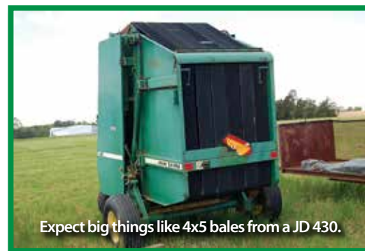
Expect big things like 4x5 bales from a JD 430.