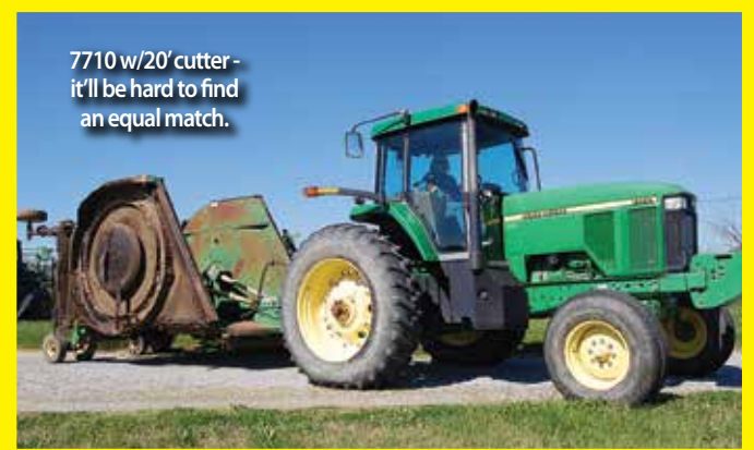
7710 w/20' cutter - it'll be hard to find an equal match.

THE KIND -U- WOULD BE PROUD TO BUY & GIVE TO YOUR MAMA