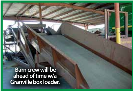
Barn crew will be ahead of time w/a Granville box loader.