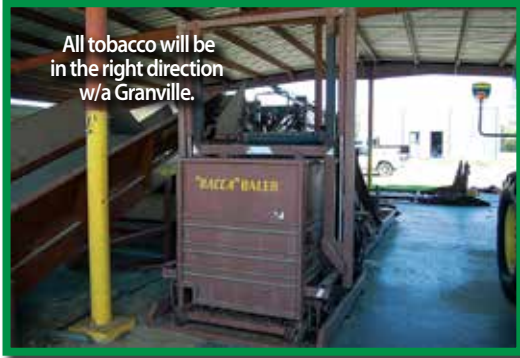
All tobacco will be in the right direction w/a Granville.