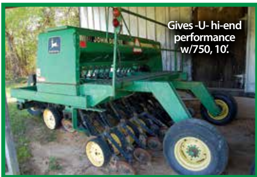
Gives -U- hi-end performance w/750, 10'.