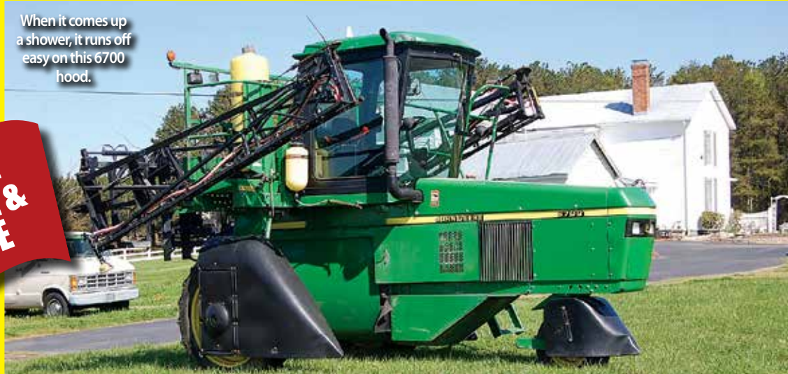
When it comes up a shower, it runs off easy on this 6700 hood.