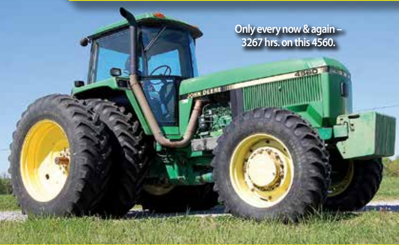
Only every now & again – 3267 hrs. on this 4560.

SALE SITE ADDRESS: 388 MILES CREEK RD. – SOUTH HILL, VA (this is right next to Buckhorn Vol. Fire Dept).