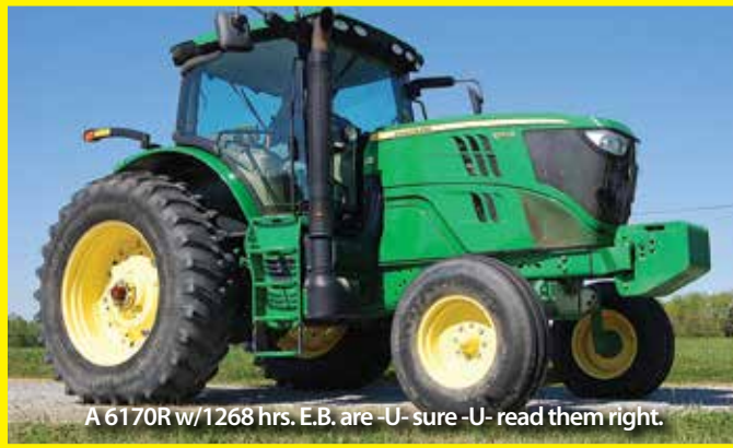
A 6170R w/1268 hrs. E.B. are -U- sure -U- read them right.