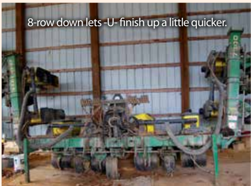
8-row down lets -U- finish up a little quicker.