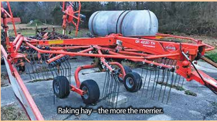
Raking hay – the more the merrier.