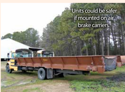
Units could be safer if mounted on air brake carriers.