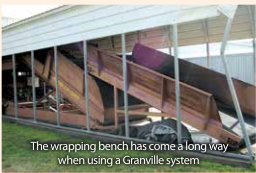
The wrapping bench has come a long way when using a Granville system

Sales Tax Info – We are now required to charge NC Sale Tax at our sales. If you we do not have a completed sales tax exempt on file, you will be charged NC Sales Tax.