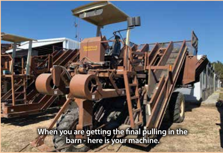
When you are getting the final pulling in the barn - here is your machine.