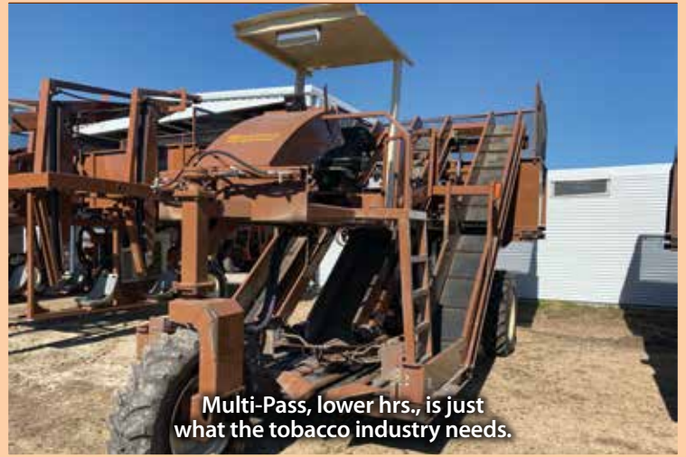
Multi-Pass, lower hrs., is just what the tobacco industry needs.