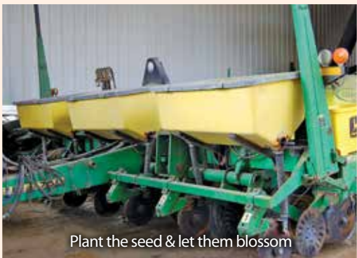
Plant the seed & let them blossom