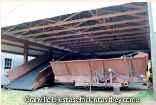
Granville is just as efficient as they come