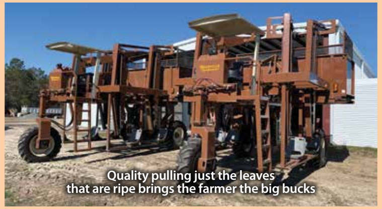
Quality pulling just the leaves that are ripe brings the farmer the big bucks