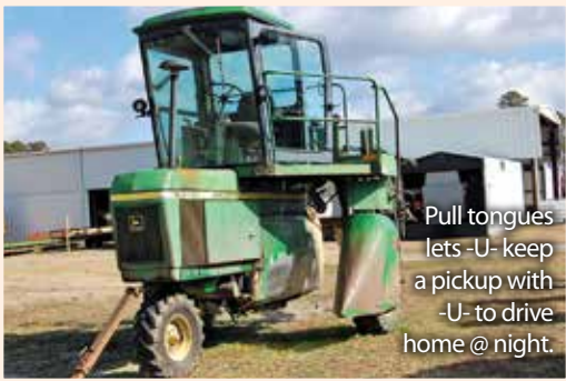
Pull tongues lets -U- keep a pickup with -U- to drive home @ night.