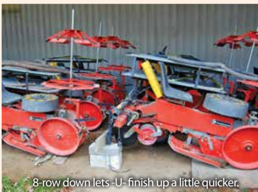
8-row down lets -U- finish up a little quicker.