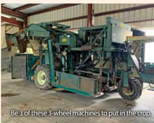
Be 3 of these 3-wheel machines to put in the crop.