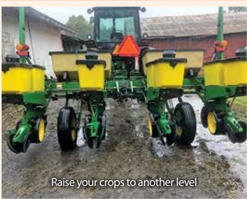
Raise your crops to another level