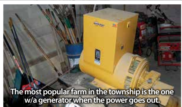
The most popular farm in the township is the one w/a generator when the power goes out.