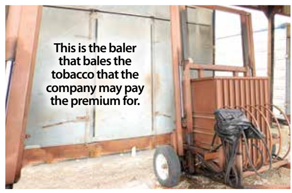
This is the baler that bales the tobacco that the company may pay the premium for.