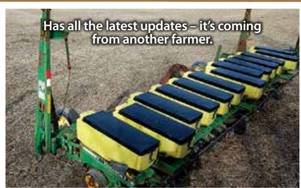
Has all the latest updates – it's coming from another farmer.