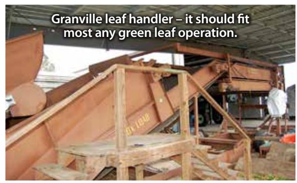
Granville leaf handler – it should fit most any green leaf operation.

Sales Tax Info – We are now required to charge NC Sale Tax at our sales. If you we do not have a completed sales tax exempt on file, you will be charged NC Sales Tax.