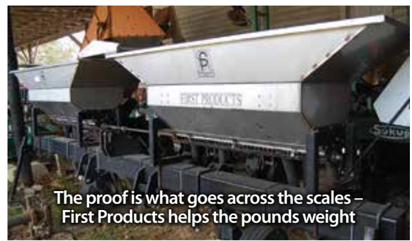
The proof is what goes across the scales – First Products helps the pounds weight