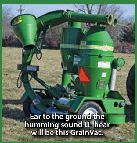
Ear to the ground the humming sound U- hear will be this GrainVac.