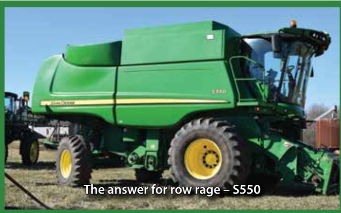
The answer for row rage – S550