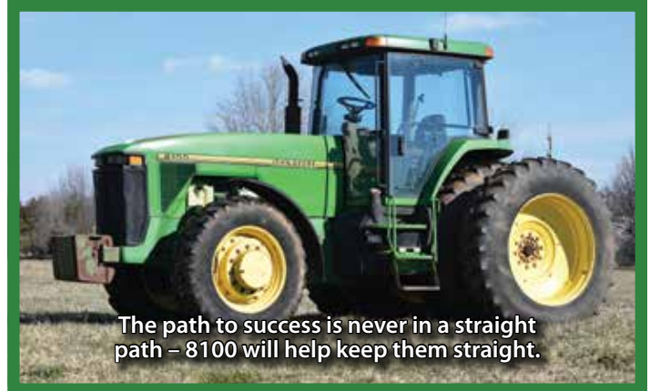
The path to success is never in a straight path – 8100 will help keep them straight.