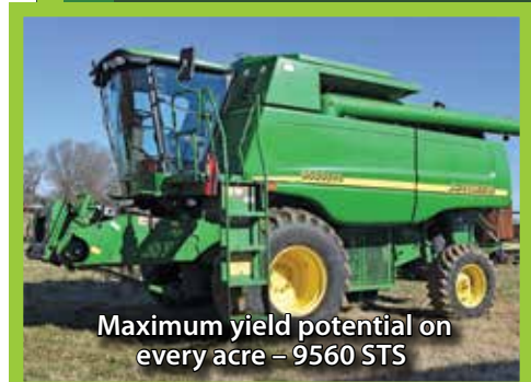
Maximum yield potential on every acre – 9560 STS