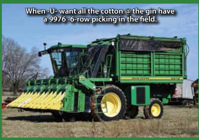
When -U- want all the cotton @ the gin have a 9976 -6-row picking in the field.