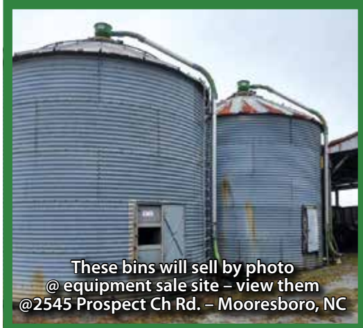
These bins will sell by photo @ equipment sale site – view them @2545 Prospect Ch Rd. – Mooresboro, NC