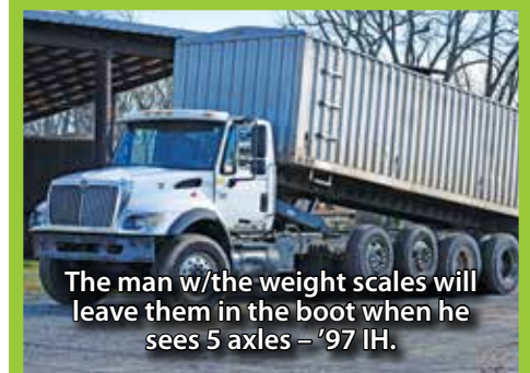
The man w/the weight scales will leave them in the boot when he sees 5 axles – '97 IH.