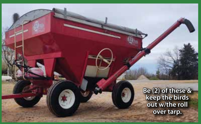
Be (2) of these & keep the birds out w/the roll over tarp.