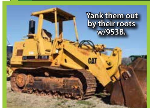
Yank them out by their roots w/953B.