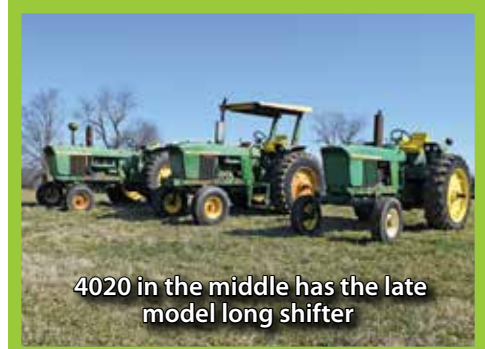
4020 in the middle has the late model long shifter

We are now required by NC Dept. of Revenue to charge sales tax unless we have a completed sale tax-exempt form E595E on file.