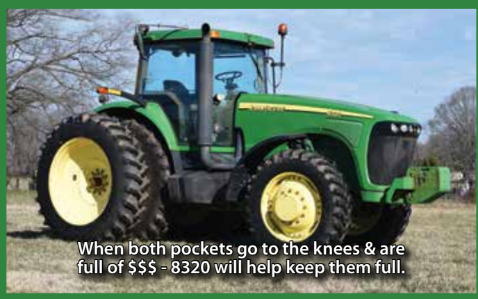
When both pockets go to the knees & are full of $$$ - 8320 will help keep them full.

SALE SITE ADDRESS: 321 Bradley Rd. – Shelby, NC 28152