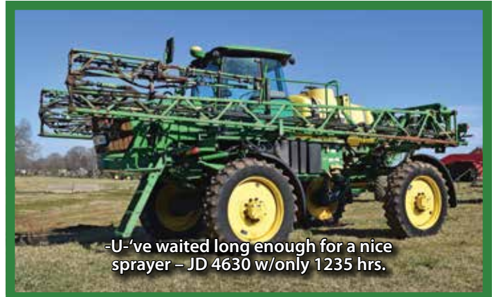
-U-ve waited long enough for a nice sprayer – JD 4630 w/only 1235 hrs.