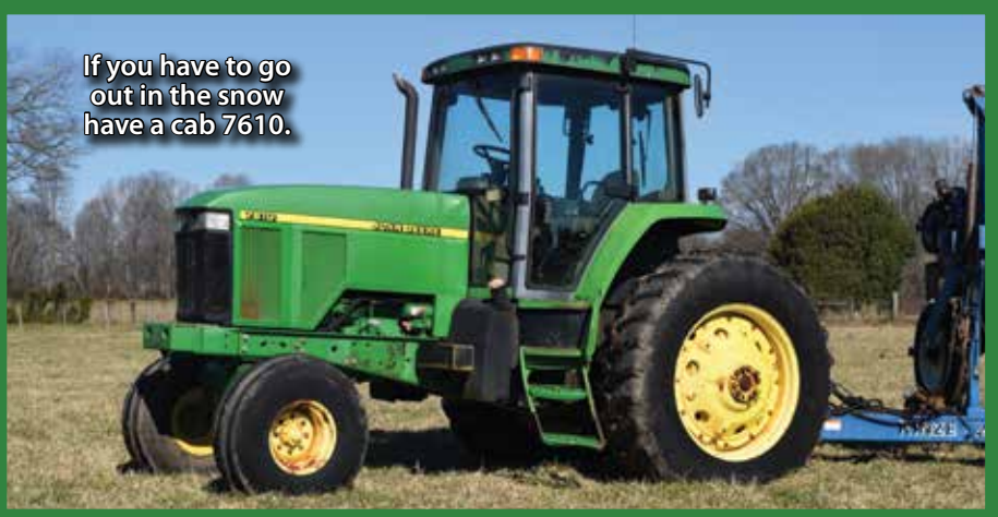
If you have to go out in the snow have a cab 7610.