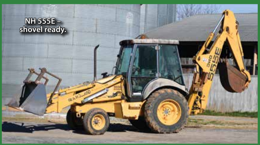
NH 555E – shovel ready.