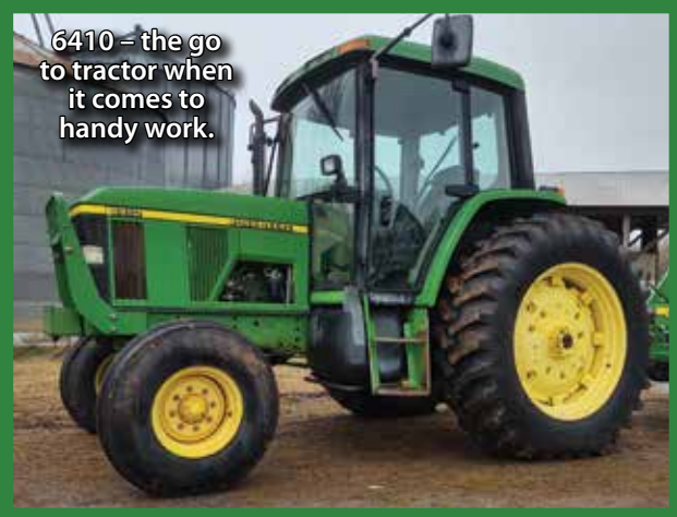
6410 – the go to tractor when it comes to handy work.