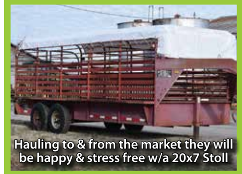
Hauling to & from the market they will be happy & stress free w/a 20x7 Stoll