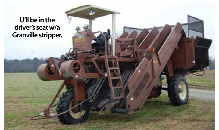
U'll be in the driver's seat w/a Granville stripper.