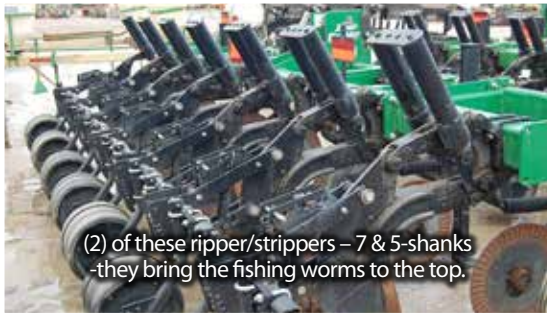
(2) of these ripper/strippers – 7 & 5-shanks -they bring the fishing worms to the top.