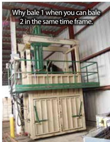
Why bale 1 when you can bale 2 in the same time frame.