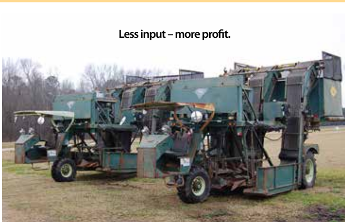
Less input – more profit.

This farm is continuing in the sweet potato business & other crops - just discontinuing their Tobacco operation