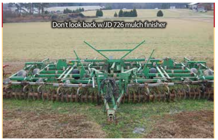
Don't look back w/JD 726 mulch finisher