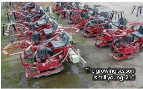
The growing season is still young. 210