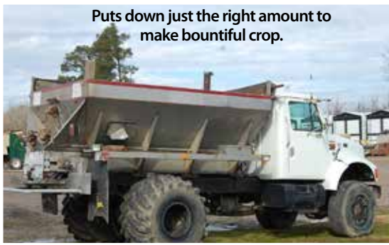
Puts down just the right amount to make bountiful crop.