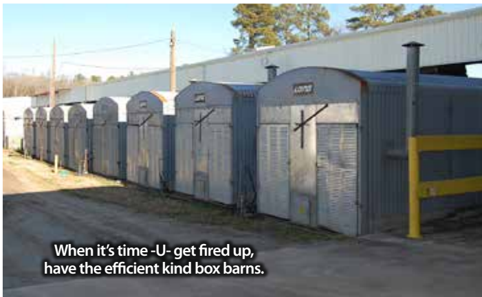
When it's time -U- get fired up, have the efficient kind box barns.

SALE SITE ADDRESS: 1280 Macedonia Rd. – Spring Hope NC 27882