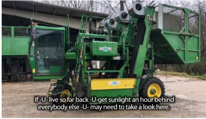
If-U- live so far back -U- get sunlight an hour behind everybody else -U- may need to take a look here.