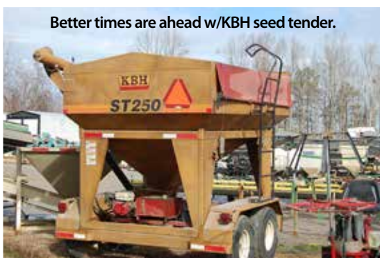
Better times are ahead w/KBH seed tender.