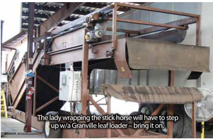
The lady wrapping the stick horse will have to step up w/a Granville leaf loader – bring it on.