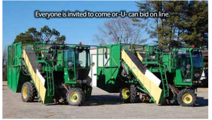
Everyone is invited to come or -U- can bid on line.