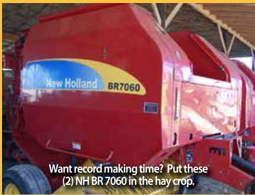
Want record making time? Put these (2) NH BR 7060 in the hay crop.

Sales Tax Info – We are now required to charge NC Sale Tax at our sales. If you we do not have a completed sales tax exempt on file, you will be charged NC Sales Tax.