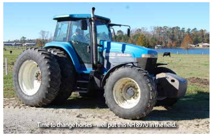
Time to change horses – well put this NH 8970 in the field.