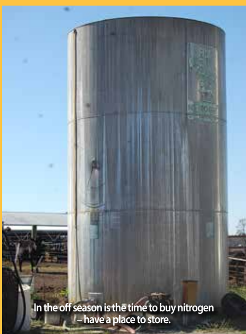
In the off season is the time to buy nitrogen – have a place to store.