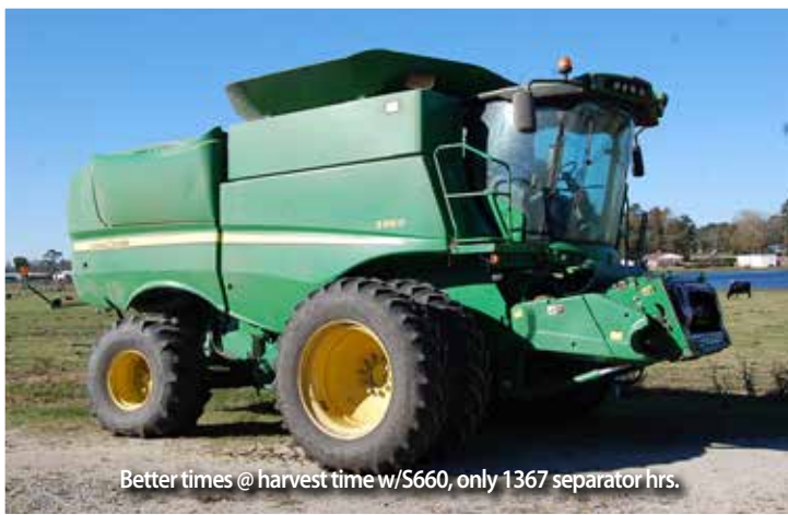
Better times @ harvest time w/S660, only 1367 separator hrs.

NOTE: GPS will stop you before you get to sale site. If you follow E.B.'s GPS it will get you within 3 miles.