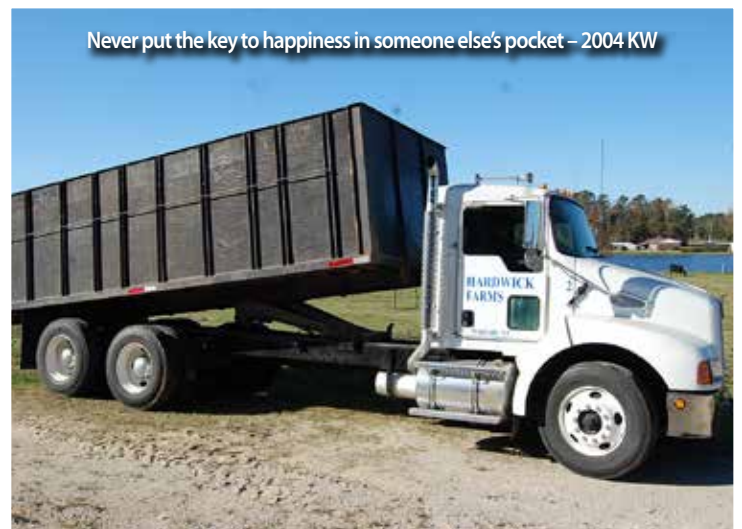
Never put the key to happiness in someone else's pocket – 2004 KW