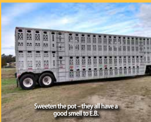
Sweeten the pot – they all have a good smell to E.B.