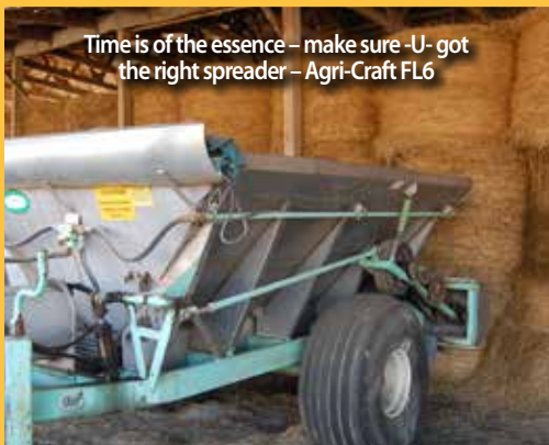
Time is of the essence – make sure -U- got the right spreader – Agri-Craft FL6