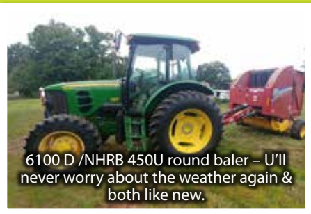
6100 D /NHRB 450U round baler – U'll never worry about the weather again & both like new.

Case 5100 Soybean Special , 18-drop grain drill, w/press wheels, set on 7" spacing, SN-0390206C001014084.