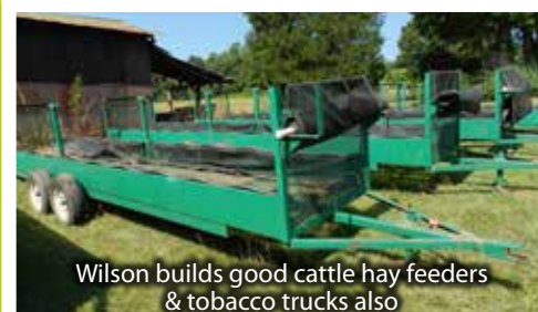
Wilson builds good cattle hay feeders & tobacco trucks also