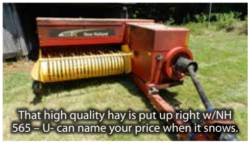
That high quality hay is put up right w/NH 565 – U- can name your price when it snows.