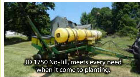
JD 1750 No-Till, meets every need when it come to planting.