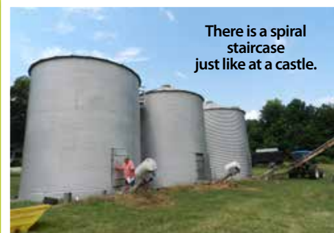
There is a spiral staircase just like at a castle.