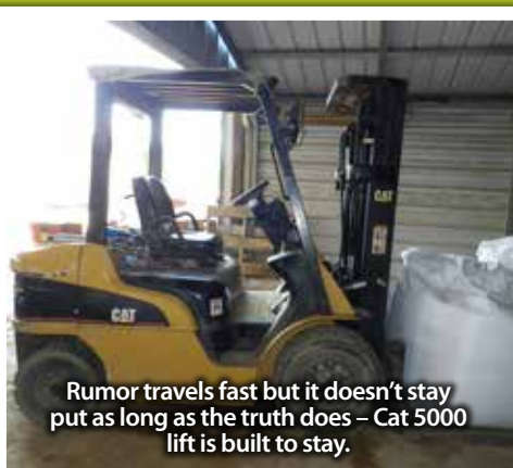
Rumor travels fast but it doesn't stay put as long as the truth does - Cat 5000 lift is built to stay.