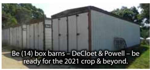
Be (14) box barns – DeCloet & Powell – be ready for the 2021 crop & beyond.