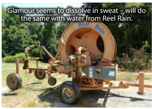
Glamour seems to dissolve in sweat – will do the same with water from Reel Rain.