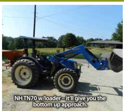
NH TN70 w/loader - it'll give you the bottom up approach.