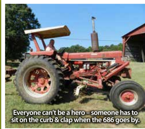
Everyone can't be a hero - someone has to sit on the curb & clap when the 686 goes by.