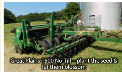
Great Plains 1500 No-Till – plant the seed & let them blossom

Sales Tax Info – We are now required to charge NC Sale Tax at our sales. If you do not have a completed sales tax exempt on file, you will be charged NC Sales Tax.