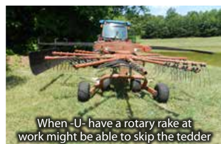
When -U- have a rotary rake at work might be able to skip the tedder