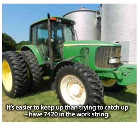
It's easier to keep up than trying to catch up - have 7420 in the work string.

SALE SITE ADDRESS: 900 Lauren Rd. - Stokesdale, NC 27357