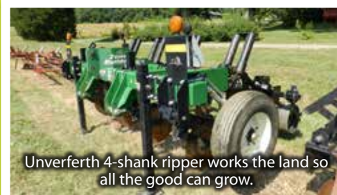
Unverferth 4-shank ripper works the land so all the good can grow.