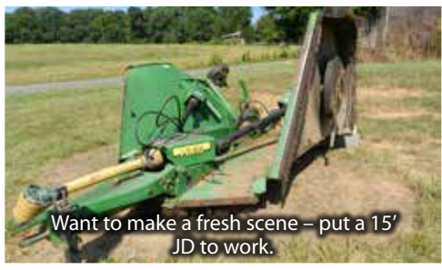
Want to make a fresh scene – put a 15' JD to work.