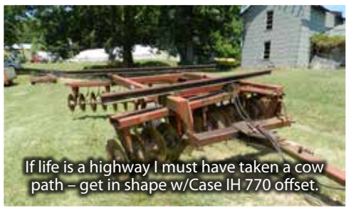
If life is a highway I must have taken a cow path – get in shape w/Case IH 770 offset.