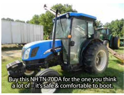
Buy this NH TN 70DA for the one you think a lot of – it's safe & comfortable to boot.