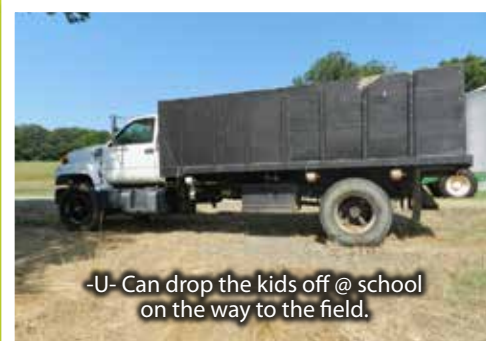
-U- Can drop the kids off @ school on the way to the field.