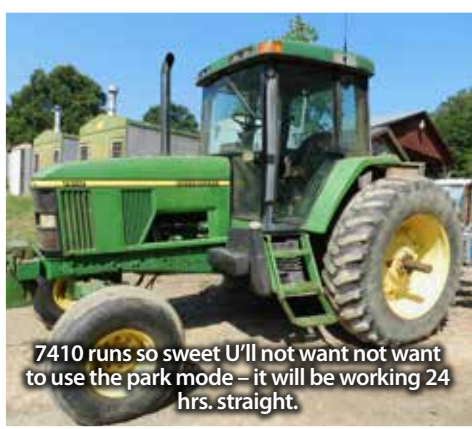
7410 runs so sweet U'll not want to use the park mode - it will be working 24 hrs. straight.