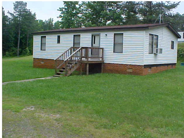
Main Structure Photo