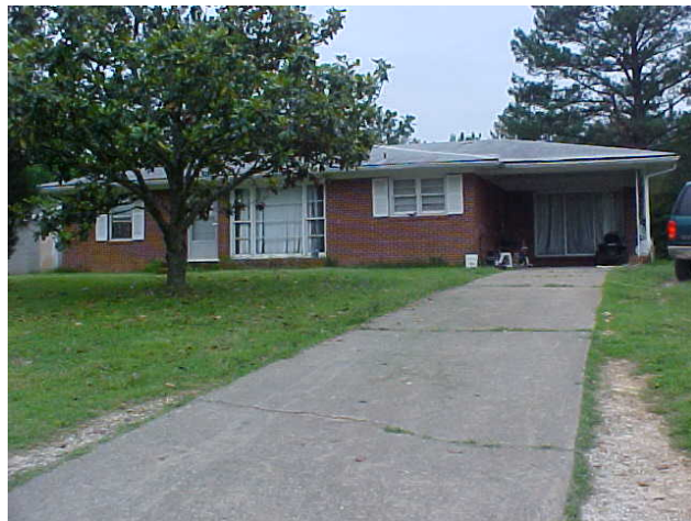
Main Structure Photo