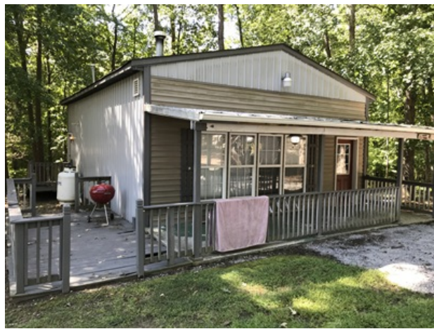
Main Structure Photo