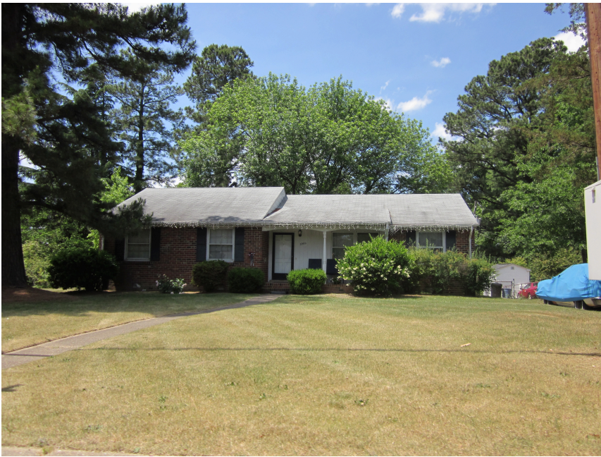
Last Photo Update 06/18/2021