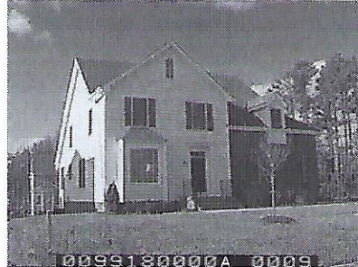
Last Photo Update 01/16/1997