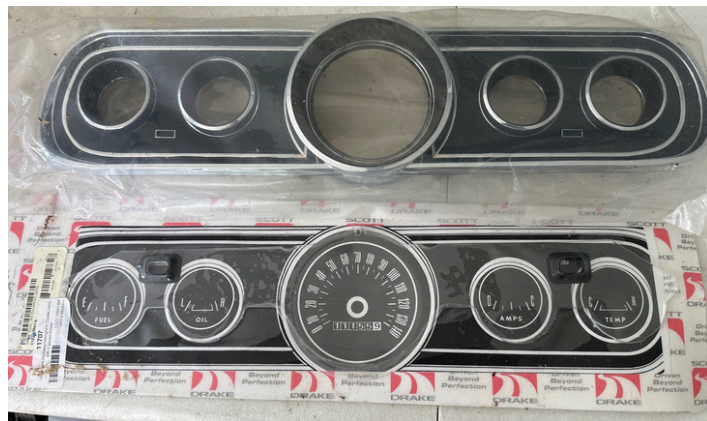
Lot 4-47 : 1966 Parts

BIDDING ENDS ON WEDNESDAY 8/20 @ 12 NOON