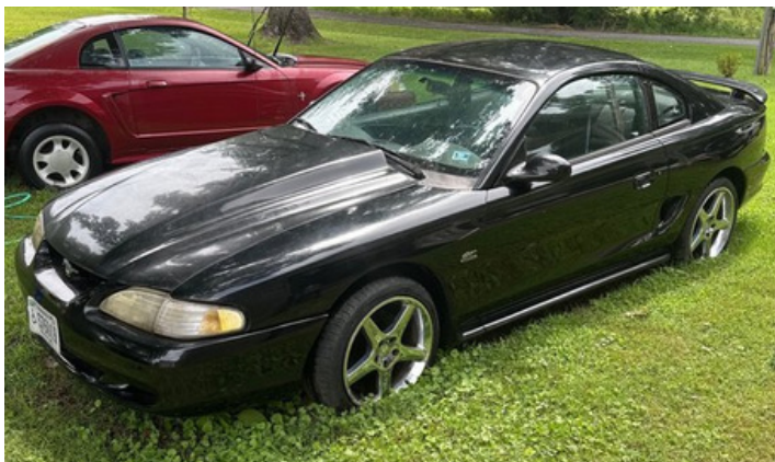
Lot 2 : 1995

BIDDING ENDS ON WEDNESDAY 8/20 @ 12 NOON