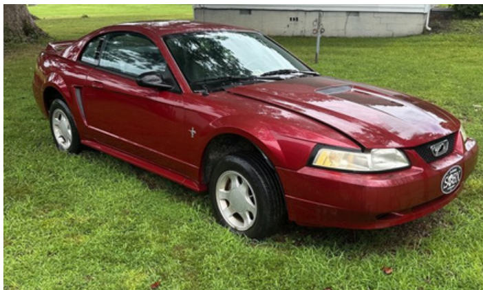
Lot 3 : 2000