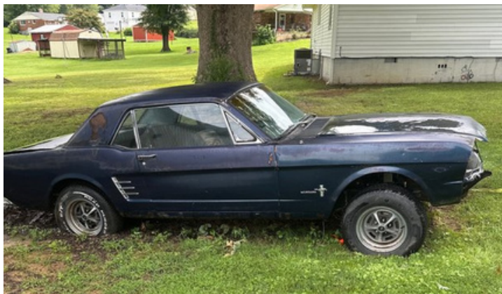
Lot 1 : 1966