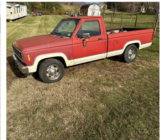
1987 Ford Ranger Vin # 1FTBR10TXHUC67620 Needs Transmission Work