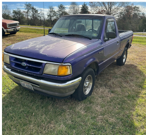
1995 Ford Ranger Pickup Truck 459,811 miles Vin # 1FTCR10A9SUB87140