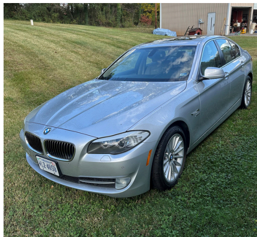
2011 BMW 535i xDrive Sedan 34,000 miles Vin # WBAFU7C58BC878031 Excellent Condition