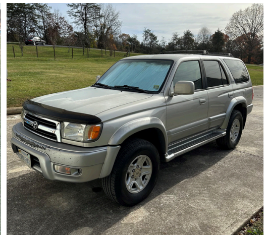
1999 Toyota 4 Runner Limited 297,405 miles Vin # JT3HN87R8X0207953 One owner