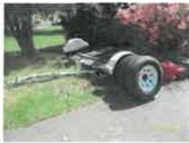
#10 • Lot 10 MasterTow car trailer with 2 spare tires