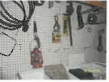
#74 • Lot 74 Misc. tools and items hanging on wall