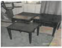
#50 • Lot 50 3 tables