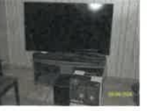
#49 • Lot 49 Sony 65" TV with Klipsch speakers and sound bar plus TV cabinet