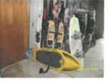
#77 • Lot 77 Misc. water skis, knee board, snowboard, life jacket for dog