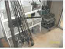
#75 • Lot 75 Fishing rods, tackle boxes, lures, plus white storage bin