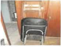
#61 • Lot 61 Wooded 6' step ladder, 2 folding metal chairs, folding step stool