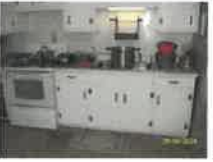
#44 • Lot 44 Misc. pots and pans