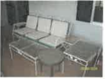
#43 • Lot 43 Metal framed sofa (70" long) and 5 tables