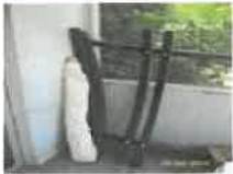
#56 • Lot 56 Canvas hammock