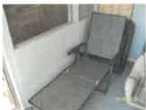
#59 • Lot 59 4 folding lounge chairs