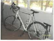
#41 • Lot 41 Norcross Jonathan Page Series aluminum frame bicycle with tire pump