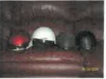
#23 • Lot 23 4 helmets