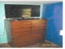
#36 • Lot 36 7 drawer chest with Vizio 38" TV