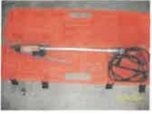
#72 • Lot 72 Milwaukee Screw Driver Power Unit System 6702-20 in PAM Case a- x Milwaukee Screw Driver Power Unit System 6702-20 in PAM Case a- x