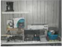
#52 • Lot 52 Misc. items on table to include the table