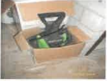
#62 • Lot 62 Portland electric pressure washer, 1,750 psi, 1.3 gpm