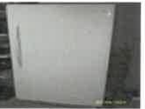
#66 • Lot 66 Frigidare Model #LFFH17F3QWC freezer (34"w x 28.5d x 67.5h)