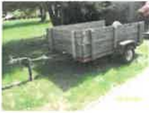
#11 • Lot 11 Utility trailer