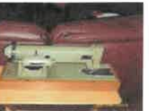
#27 • Lot 27 White sewing machine with carrying case