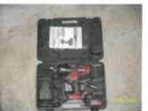
#68 • Lot 68 Earthquake XT Model EQ12XT-20V 1/2" cordless Xtreme Torque Impact Wrench