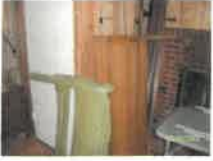
#21 • Lot 21 3 headboards and footboards with bed rails