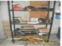
#65 • Lot 65 Rack with contents - assorted hand tools and misc. items, drop cords