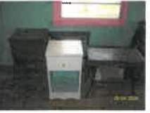
#35 • Lot 35 4 side tables