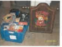
#46 • Lot 46 Box of misc. games and pool cue storage cabinet