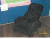
#37 • Lot 37 IJOY motorized recliner