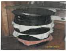
#20 • Lot 20 4 rims for a Cadillac Escalade