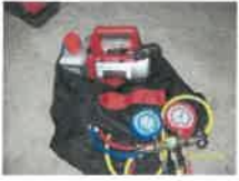
#71 • Lot 71 Rotary Vane Vacuum Pump - Model #VP135, 1/4 hp, free air displacement 3.5 cfm