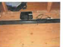
#28 • Lot 28 1 Rulu Mini LED Projector with 96" long screen