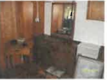
#24 • Lot 24 6 drawer chest (48"w x 16"d x 31"h), side table, pictures, footstool