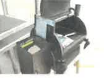
#79 • Lot 79 Traeger Grill - burns wood pellets, grill area is 22"w x 18"d, cover included