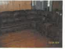
#18 • Lot 18 Sectional sofa