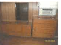
#29 • Lot 29 8 drawer dresser (64"w x 18"d x 31"h) with mirror and 4 drawer chest (38"w x 18"d x 42"h)