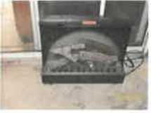
#73 • Lot 73 Electric fireplace logs - Dimplex model #DF12309 6A (23.5"w x 10"d x 20"h)