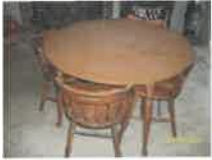
#54 • Lot 54 48" round table with 4 chairs