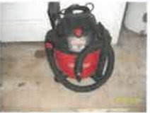
#64 • Lot 64 Craftsman 6 hp, 16 gallon shopvac