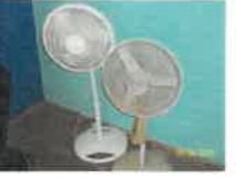
#38 • Lot 38 2 floor fans