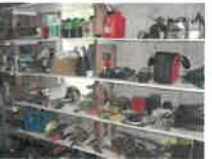
#67 • Lot 67 All contents on shelves and under shelves except for 5 items marked with a lot number