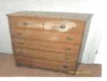
#39 • Lot 39 5 drawer chest (30"w x 16.5 d x 45"h)