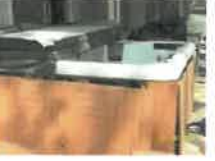
#78 • Lot 78 Hot Tub - 88" x 88"