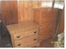
#33 • Lot 33 5 drawer chest (35"w x 18"d x 47.5"h) and 2 drawer chest (36"w x 21.5d x 31"h)