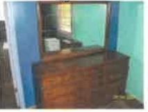
#34 • Lot 34 12 drawer chest with mirror