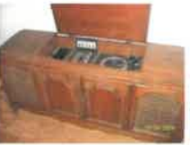
#16 • Lot 16 Motorola Stereophonic turntable and AM/FM radio in a cabinet