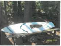
#13 • Lot 13 Alcot Sunfish sail boat complete with sail, mast, centerboard and tiller