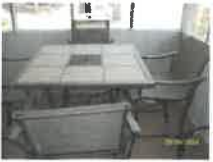
#42 • Lot 42 High top table (40" x 40" x 36"h) and 4 chairs