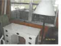
#19 • Lot 19 7 drawer desk and floor lamp - desk is 40" w x 17.5" d x 30" h