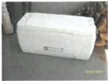
#57 • Lot 57 Igloo Maxcold Cooler - 248 can capacity