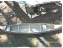
#14 • Lot 14 Starcraft aluminum canoe - 16'8" long