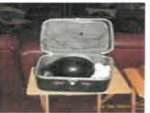
#26 • Lot 26 AMF Ambassador bowling ball