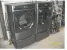
#76 • Lot 76 Kenmore Elite washer and dryer with storage drawer below each unit (27.5"w x 29"d x 53"h each)