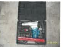
#69 • Lot 69 1" Hammer drill