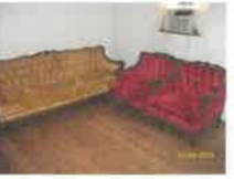
#17 • Lot 17 84" sofa and 2 side chairs