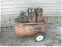
#12 • Lot 12 125 psi Sears portable air compressor, 20 gallon tank and 16' extension ladder