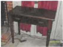
#55 • Lot 55 Table (35.5"w x 17.5"d x 31"h)