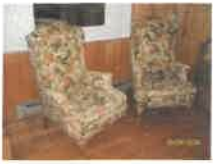
#30 • Lot 30 2 upholstered chairs