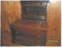
#31 • Lot 31 3 drawer chest with mirror (46"w x 22"d x 31"h)