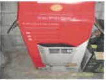
#63 • Lot 63 Portable Frigidare air conditioner, 8,000 BTU