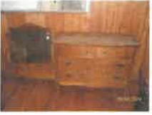
#32 • Lot 32 4 drawer Oak chest with mirror (44"w x 20.5d x 33"h)