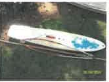
#15 • Lot 15 BIC-180 wind surfer with sail, mast and centerboard