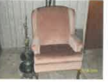
#48 • Lot 48 Upholstered chair and 2 lamps