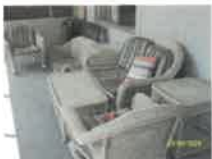
#58 • Lot 58 Wicker furniture - Loveseat, 2 rocking chairs, swinging loveseat, 3 tables, footstool