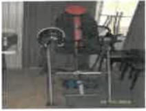
#51 • Lot 51 ATIS Inversion System