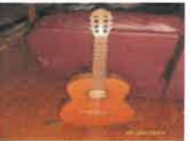
#25 • Lot 25 Orlando Model #305 guitar with stand