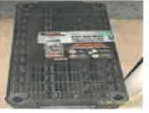
#47 • Lot 47 Heavy duty resin shelves (36"w x 18"d x 72"h) - new