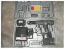
#70 • Lot 70 Senco Duraspin Screw Fastening System #DS202-14V