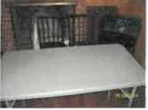
#22 • Lot 22 3 chairs, folding table, and cabinet