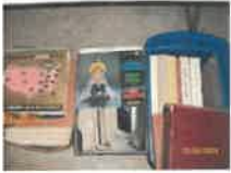
#53 • Lot 53 3 boxes of vintage record albums