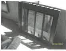
#60 • Lot 60 Fireplace insert (40.5"w x 33"h)