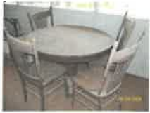
#40 • Lot 40 45" round table with 4 chairs