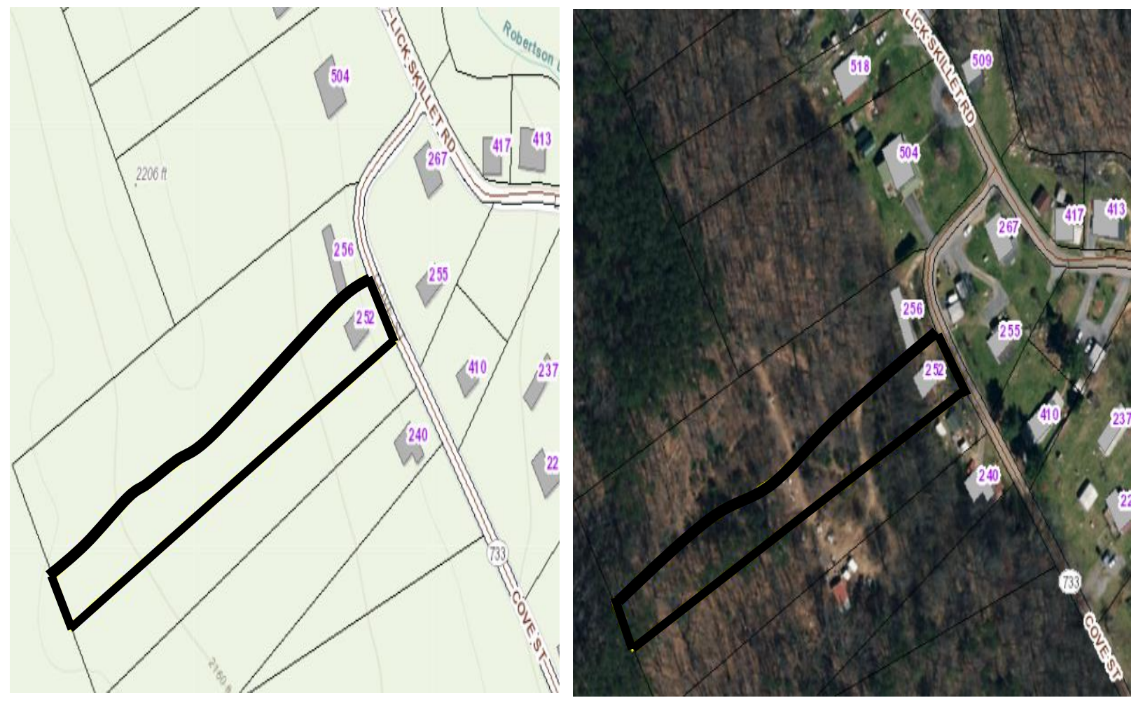
Property N3 Lola Irene Repass

Owner: Lola Irene Repass Account No.: 114472 Tax ID: 28A2-A-5A Land Value: $5,000.00 Building Value: $4,500.00 Total Value: $9,500.00 Acreage: n/a Property Description: 252 Cove Street, Saltville