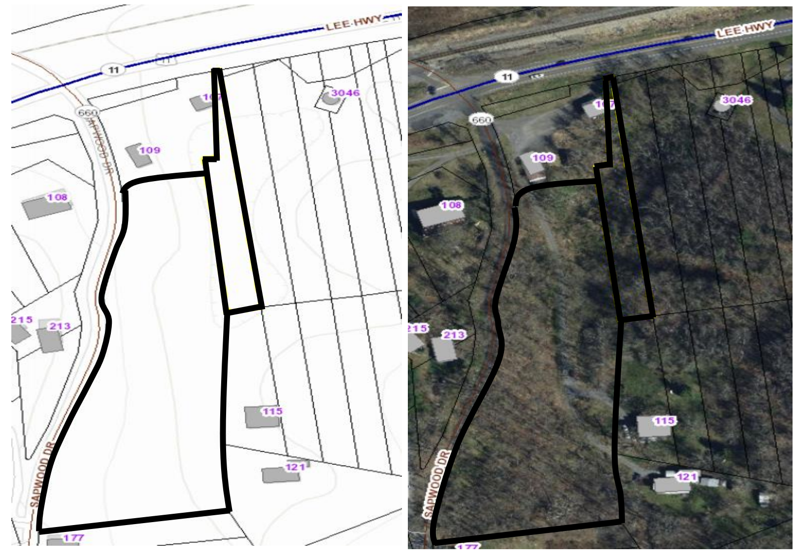
Property N5 Judy Carroll Hoover Estate, et al.

Owner: Judy Carroll Hoover Estate, et al. Account No.: 87203 Tax ID: 56F-6-59 and 56F-6-60 Land Value: $8,000.00 Building Value: n/a Total Value: $8,000.00 Acreage: n/a Property Description: Vacant; off Lee Highway and Sapwood Drive, Marion