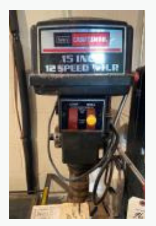
3761 Waterlick Rd : PREVIEW 1/14 & 1/21 10:30 AM to 11:30 AM