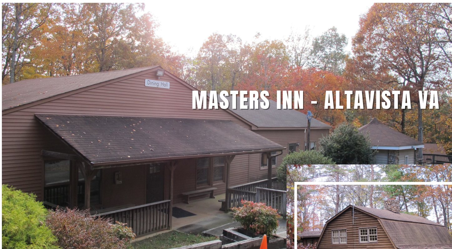
MASTERS INN - ALTAVISTA VA

445 MITCHELL SPRINGS RD ALTAVISTA VA 24517