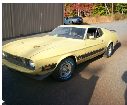
1973 Mustang Mach I