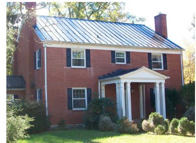
Tract 1: 8475 Cascade Rd Axton VA NOT selling at Absolute

3,336 sq ft, 4 bedrooms, 2 baths, 4 fireplaces, hardwood floors throughout, tin roof 1,500 sq ft detached garage (4 bays w/ 8'x8' doors) 34.2 +/- Acres, mostly wooded