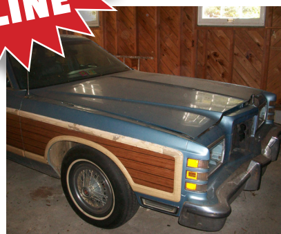
1975 Ford Country Squire