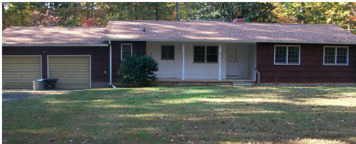
Tract 2: 7600 Morgan Ford Rd, Axton VA NOT selling at Absolute

1,360 sq ft, 3 bedrooms, 2.5 baths, attached garage, & a detached garage