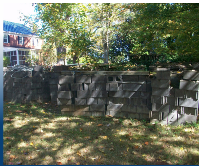
Cinderblocks Qty 1,100