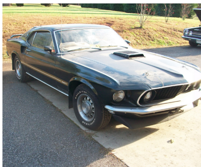
1969 Ford Mustang Cobra Jet