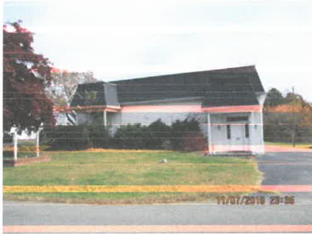
Main Structure Photo