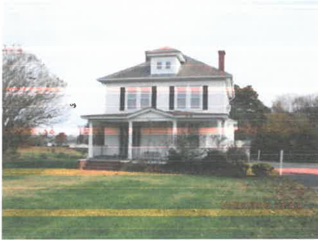
Main Structure Photo