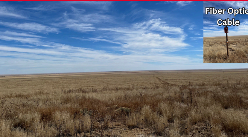
Fiber Optic Cable

Call Cary Schlosser, Listing Agent, @ 719-349-0478 for more information