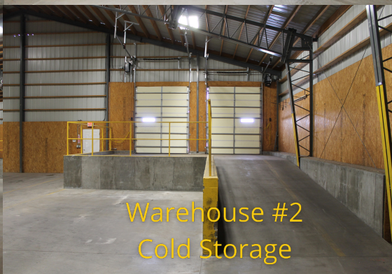
Warehouse #2 Cold Storage