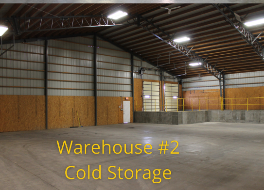
Warehouse #2 Cold Storage