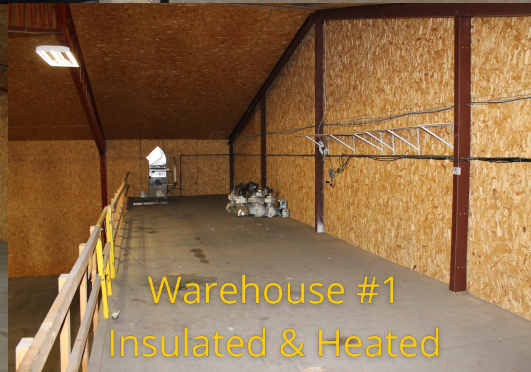
Warehouse #1 Insulated & Heated