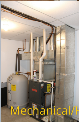
Mechanical/Hot Water Heater/Heater Room