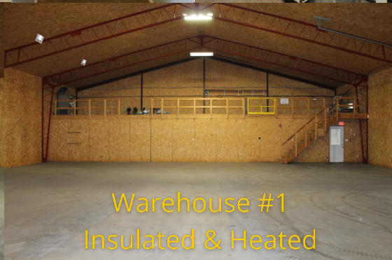
Warehouse #1 Insulated & Heated