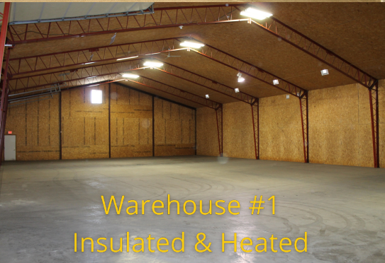
Warehouse #1 Insulated & Heated