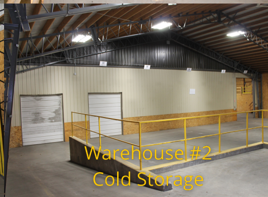
Warehouse #2 Cold Storage