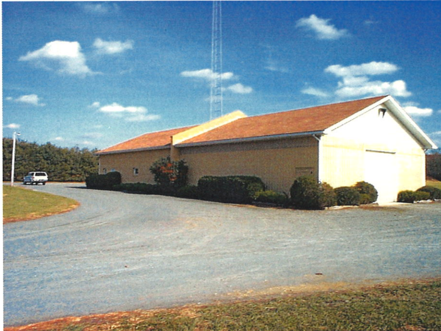
REAR OR SOUTH END