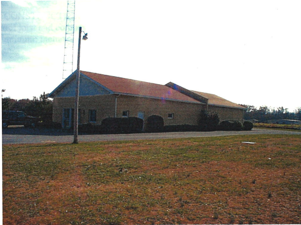
BUILDING FRONT VIEW