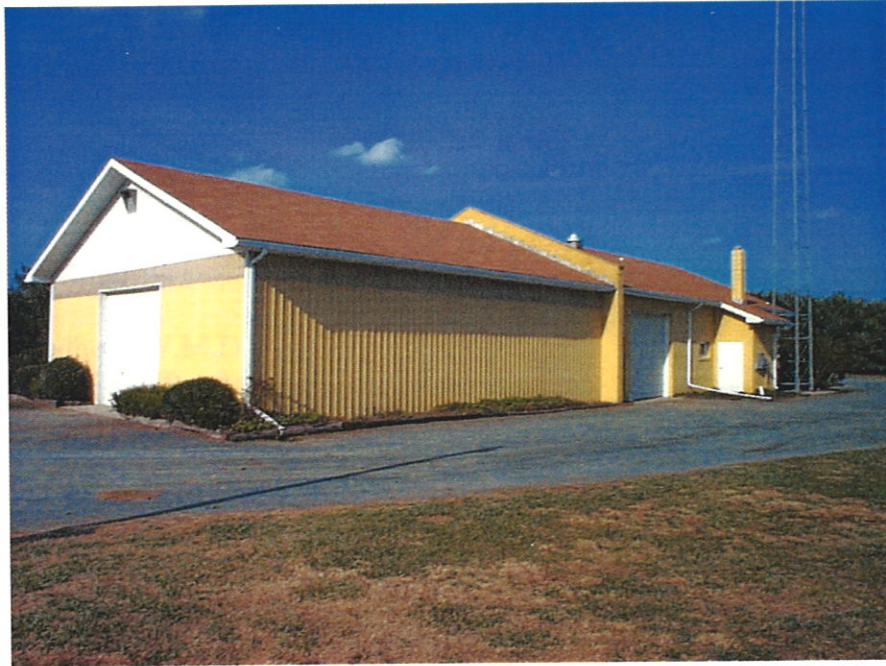
BACK – HORSE STABLES