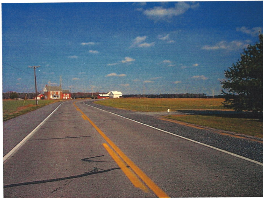
NEIGHBORHOOD VIEW SUBJECT ON RIGHT