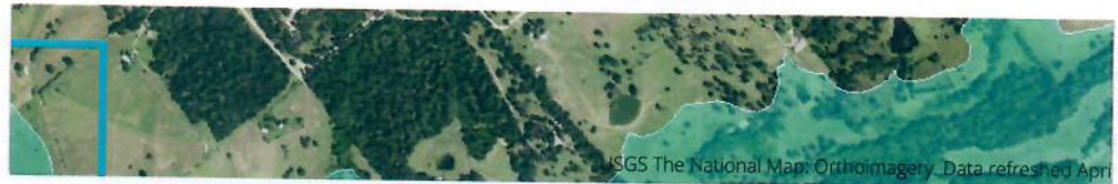
USGS The National Map: Orthoimagery_Data refreshed Apr