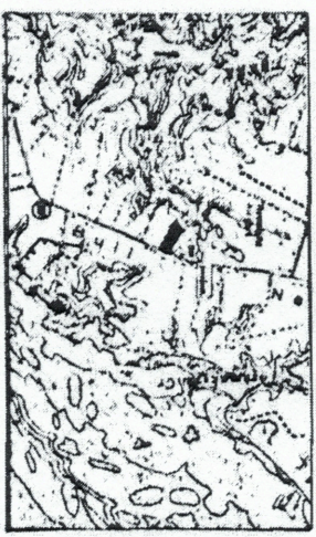
LOCATION MAP SCALE: 1"=2000'

NOTE: ALL LINES DETERMINED BY PREVIOUS SURVEYS. PARCELS B-1 AND B-2 ARE TO BE ADJUSTED TO THE CORNER OF PARCEL A. SEE SURVEY PLAN FOR DIMENSIONS. RATE MAP NORTHAMBERLAND COUNTY, VIRGINIA INFORMATION.