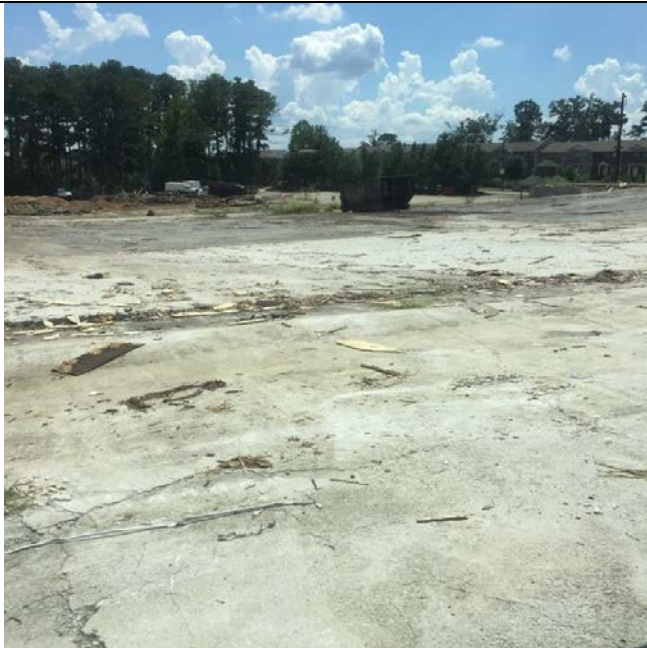
Photo depicts the former location of the site building.