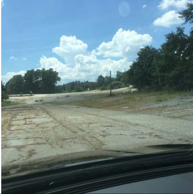
Photo depicts the southern portion of the site following demolition activities.