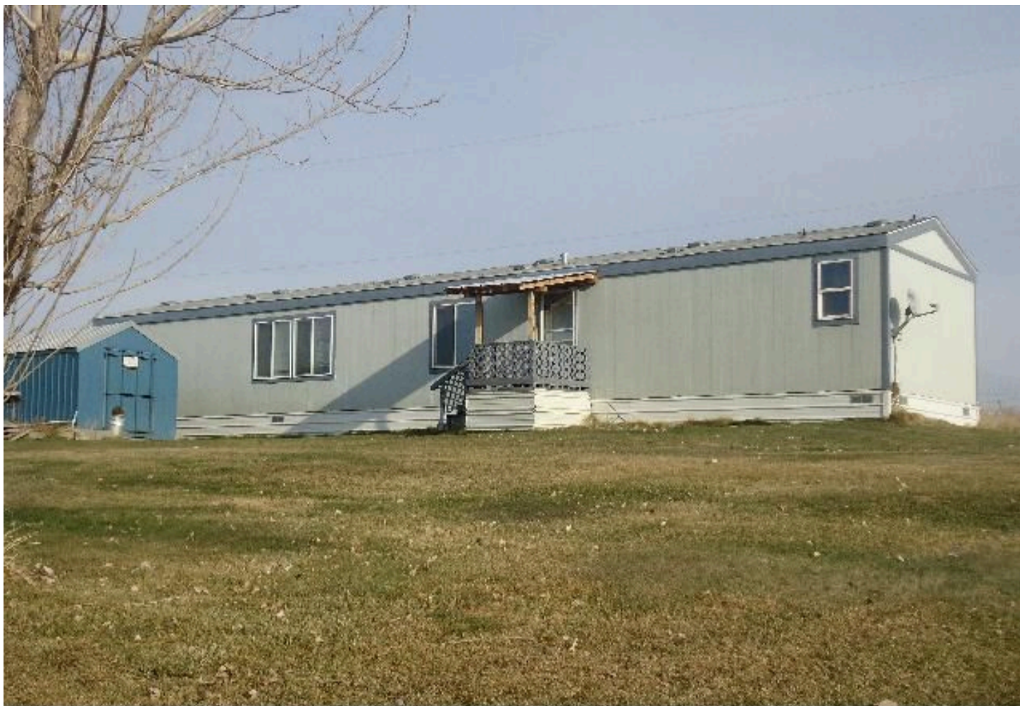
381 TREPS CT COWICHE, WA 98923-9700