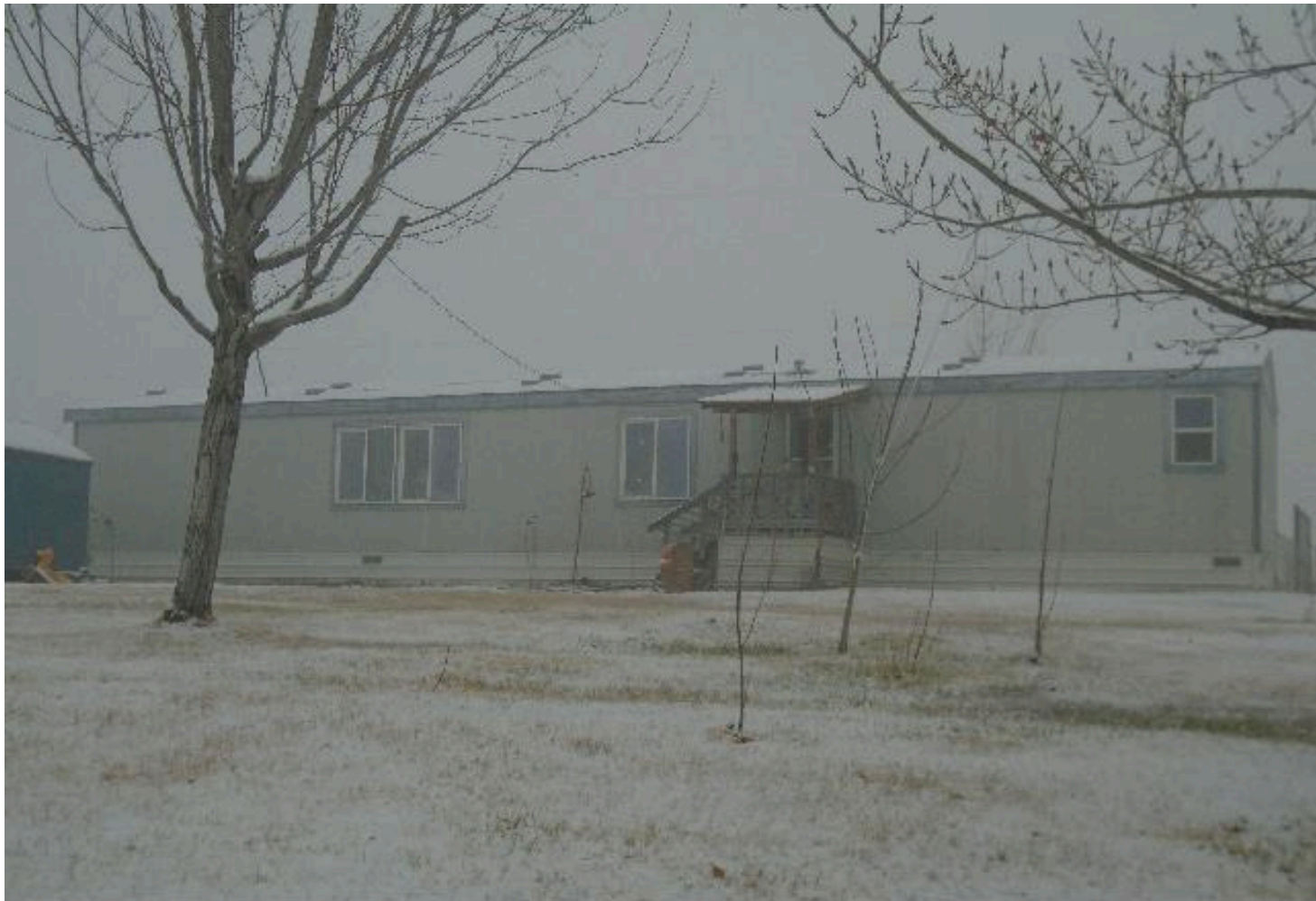
NACHES HEIGHTS/RUDD , WA