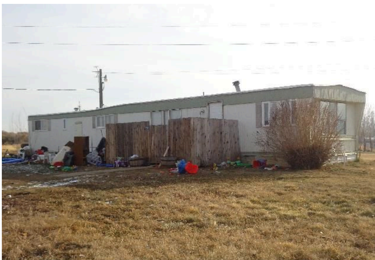
NACHES HEIGHTS/RUDD , WA