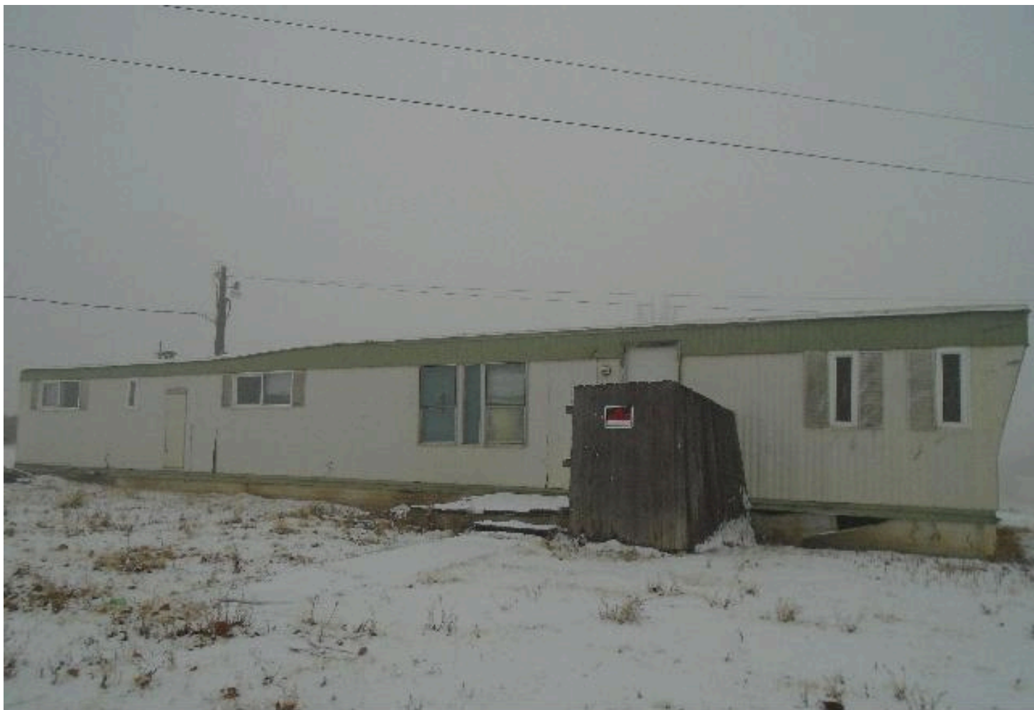
NACHES HEIGHTS/RUDD , WA