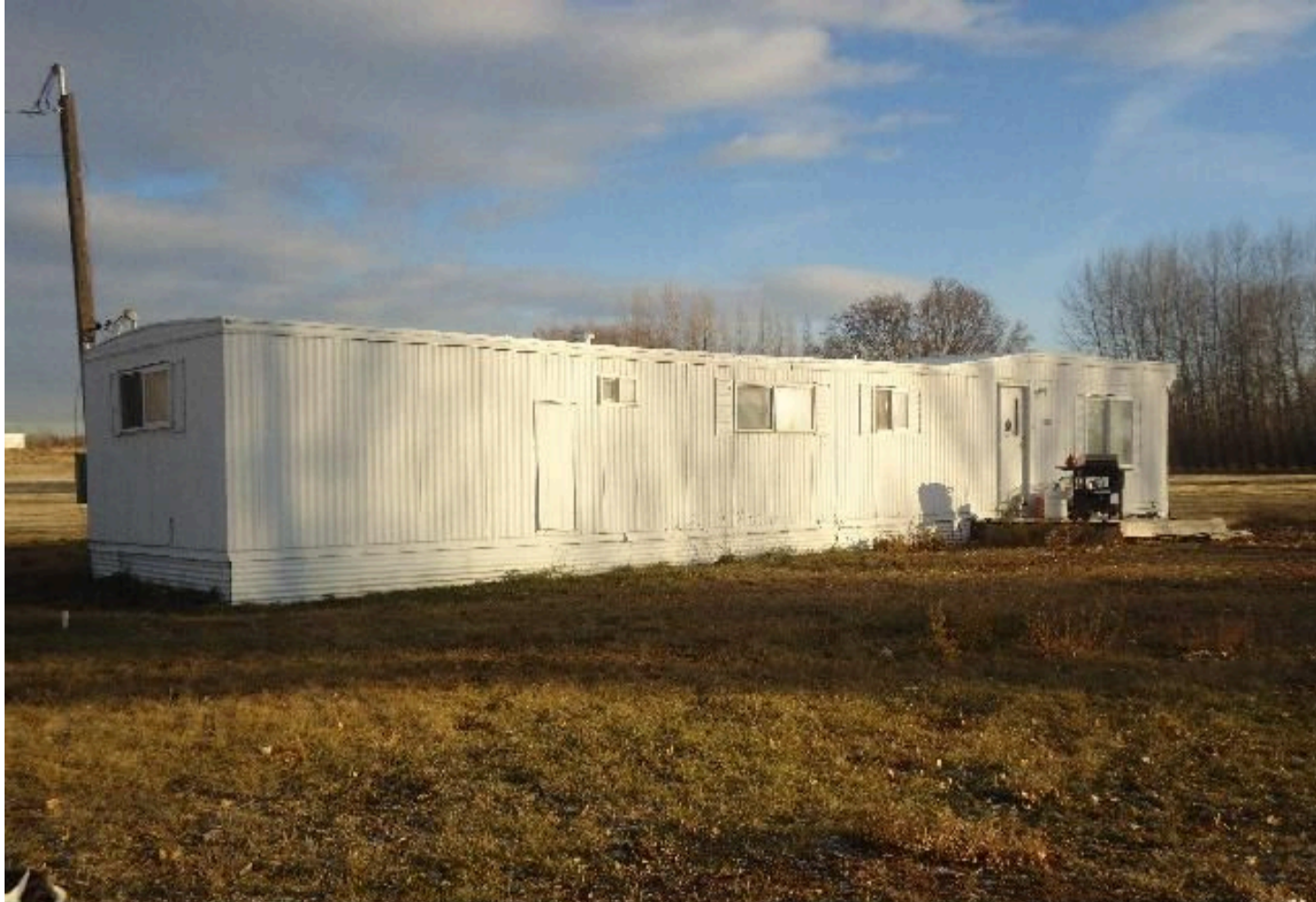
8925 NACHES HEIGHTS RD COWICHE, WA 98923-9756