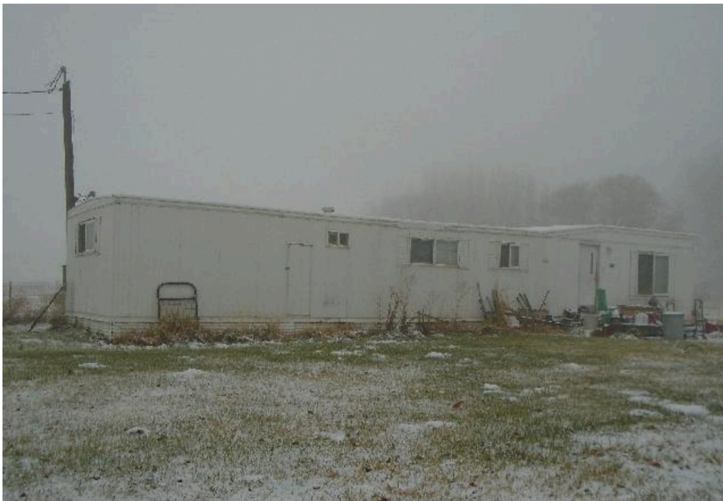
8943 NACHES HEIGHTS RD , WA