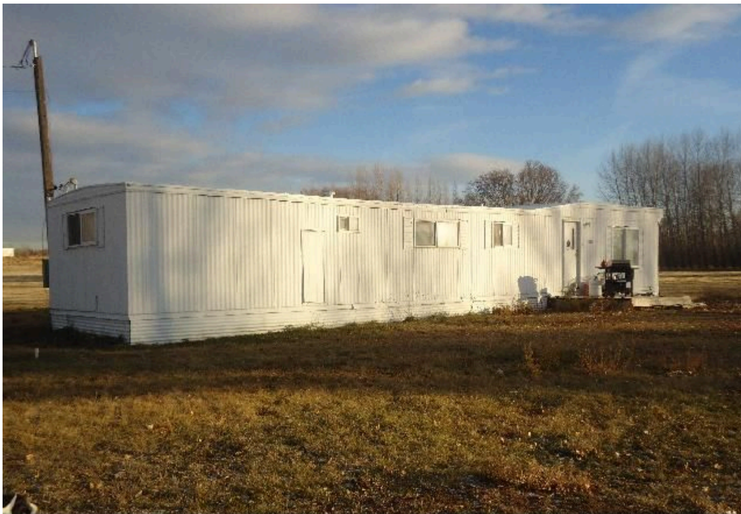
8943 NACHES HEIGHTS RD , WA