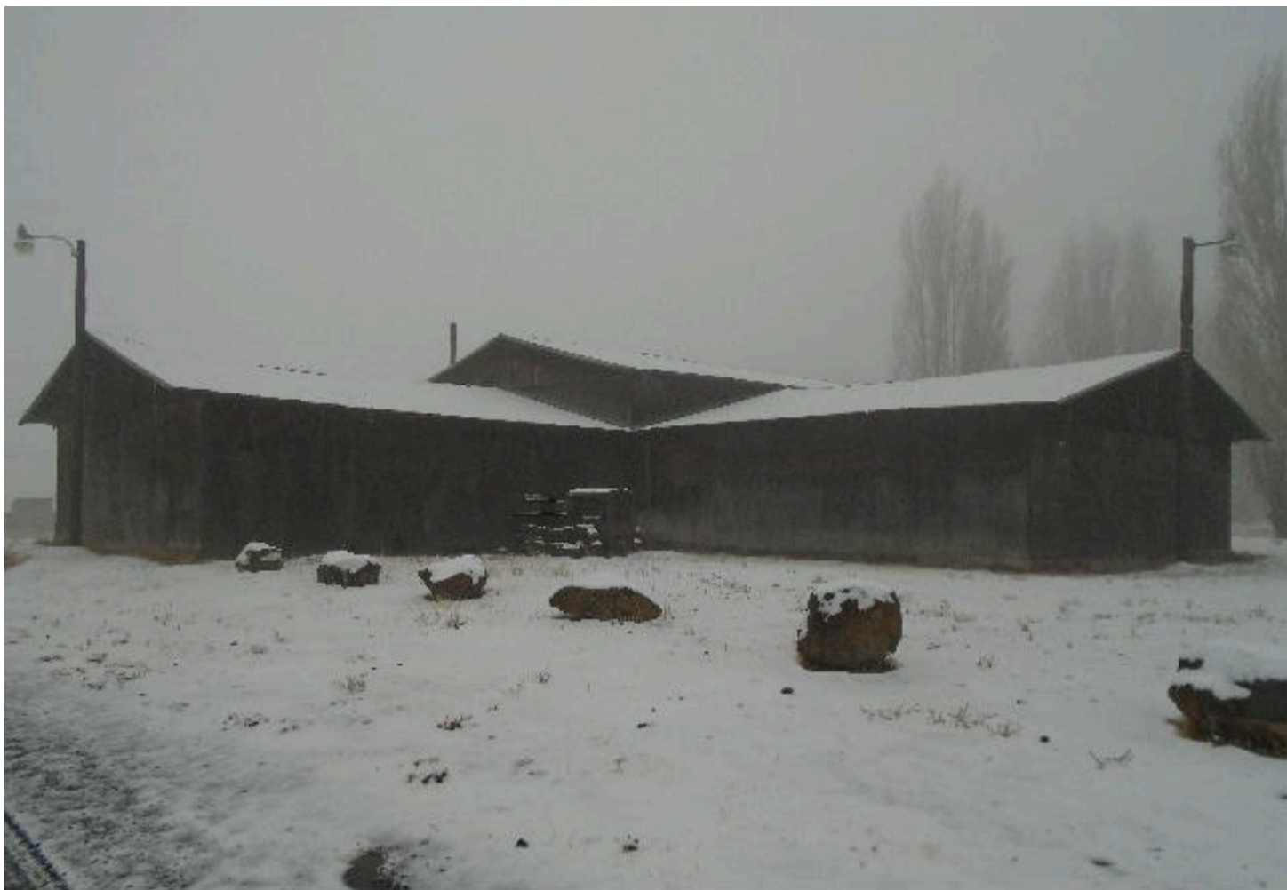
8943 NACHES HEIGHTS RD , WA