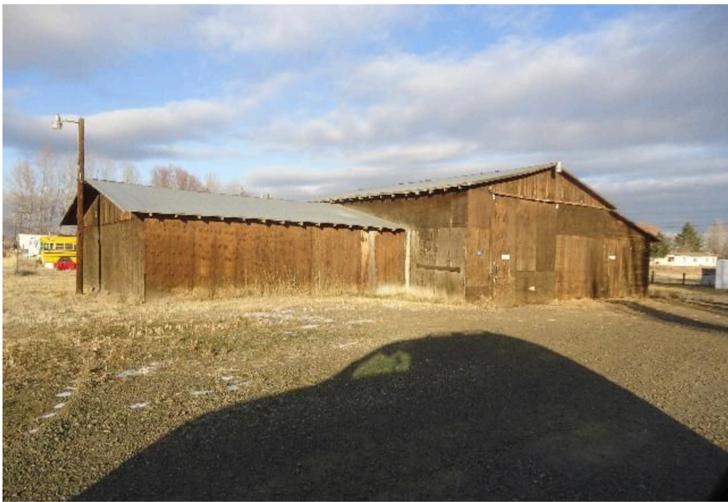
8943 NACHES HEIGHTS RD , WA