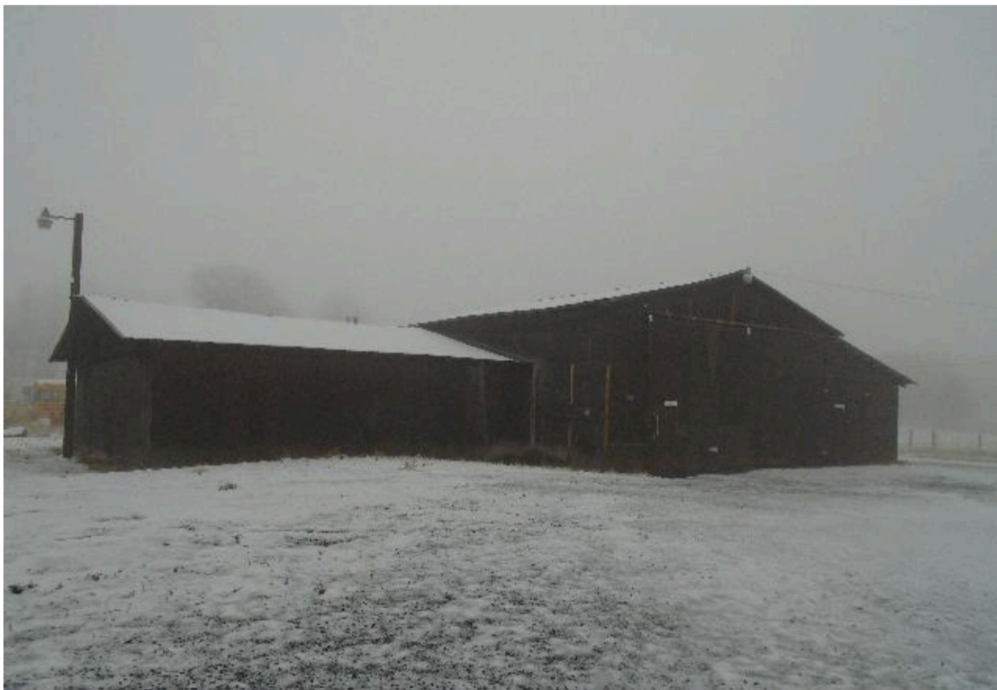
8943 NACHES HEIGHTS RD , WA