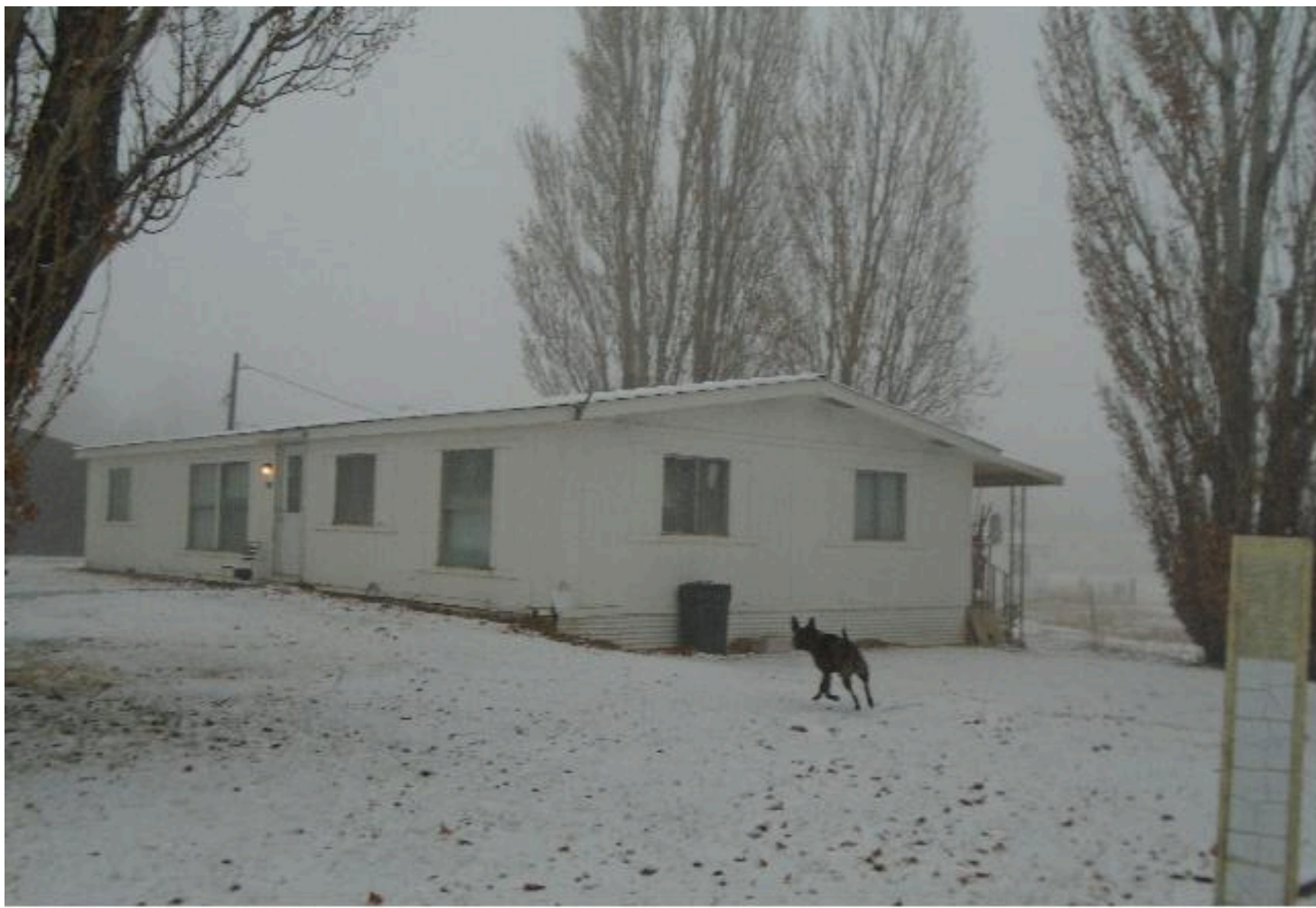
8925 NACHES HEIGHTS RD , WA