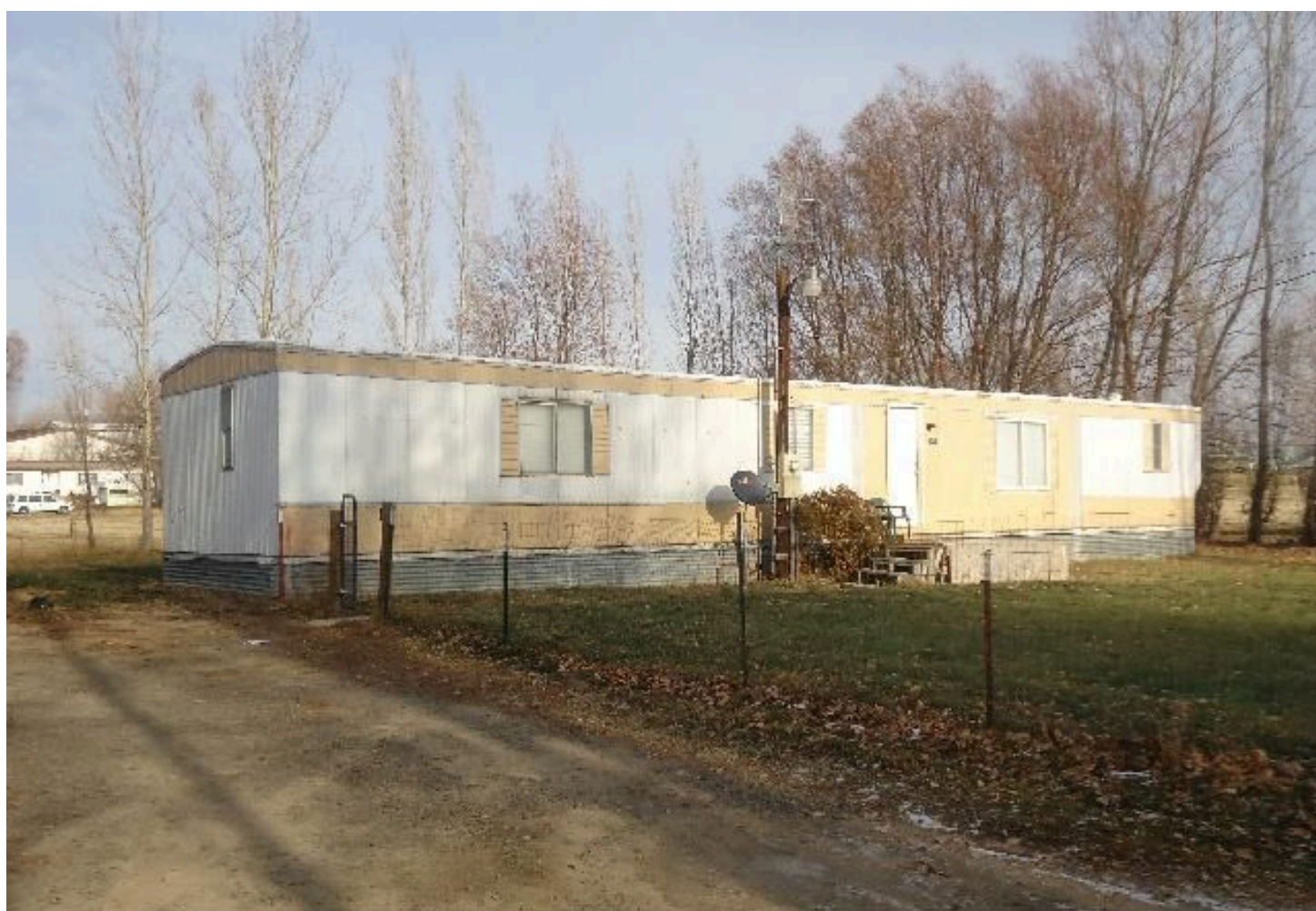
51 TREP COURT COWICHE, WA 98923