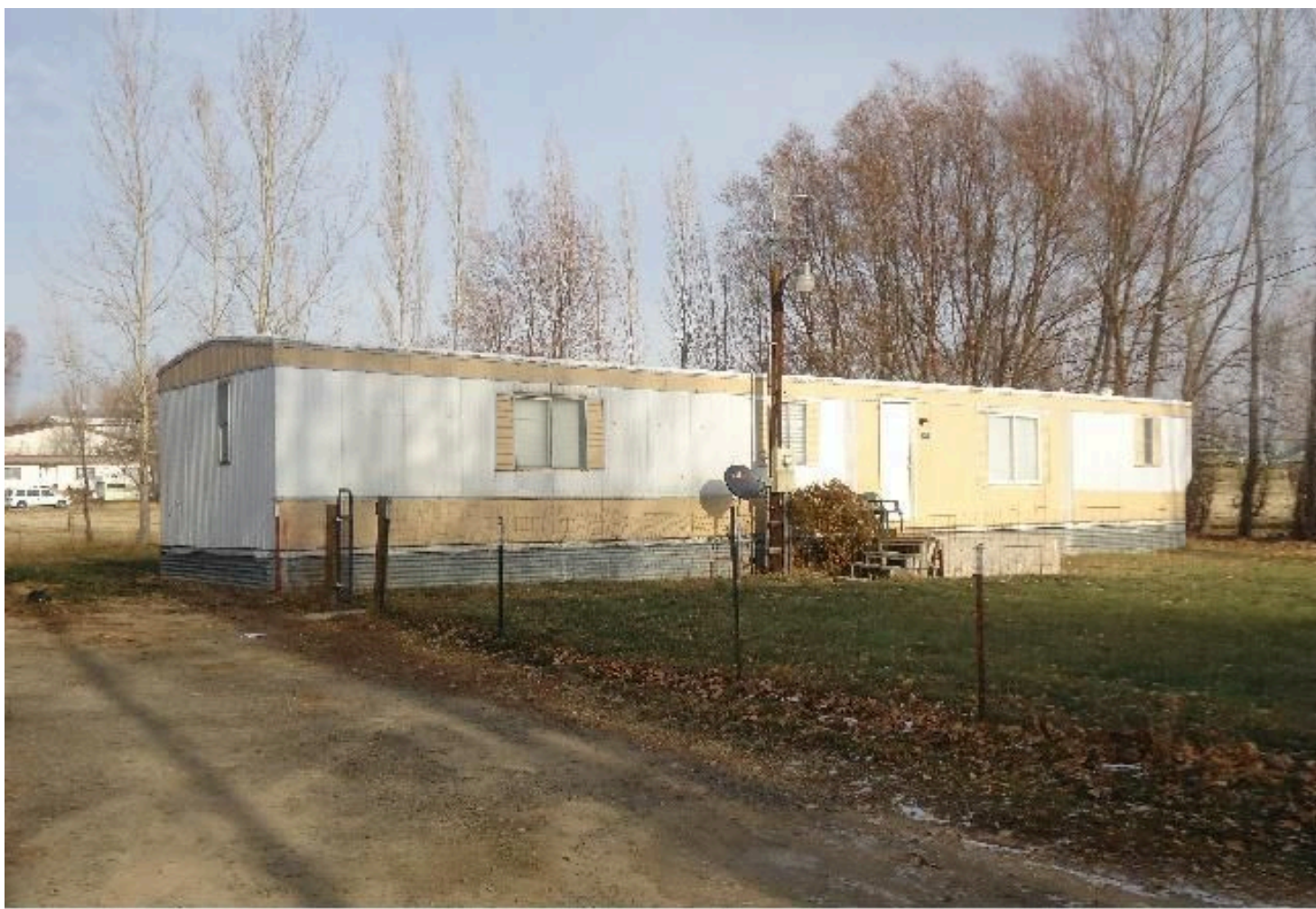
51 TREP CT , WA