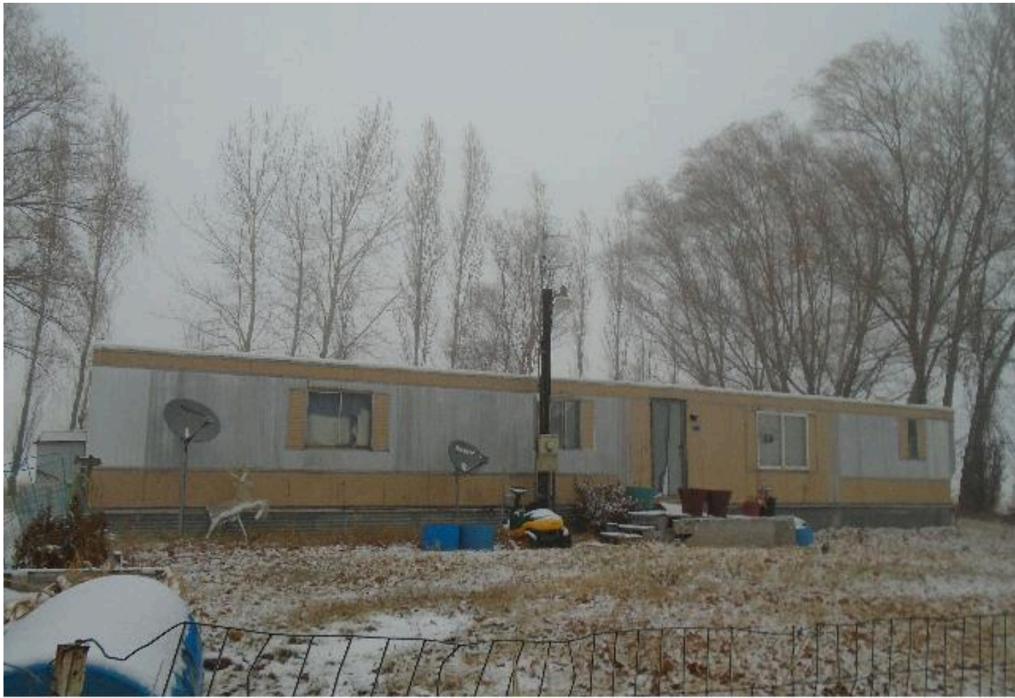
51 TREP CT , WA